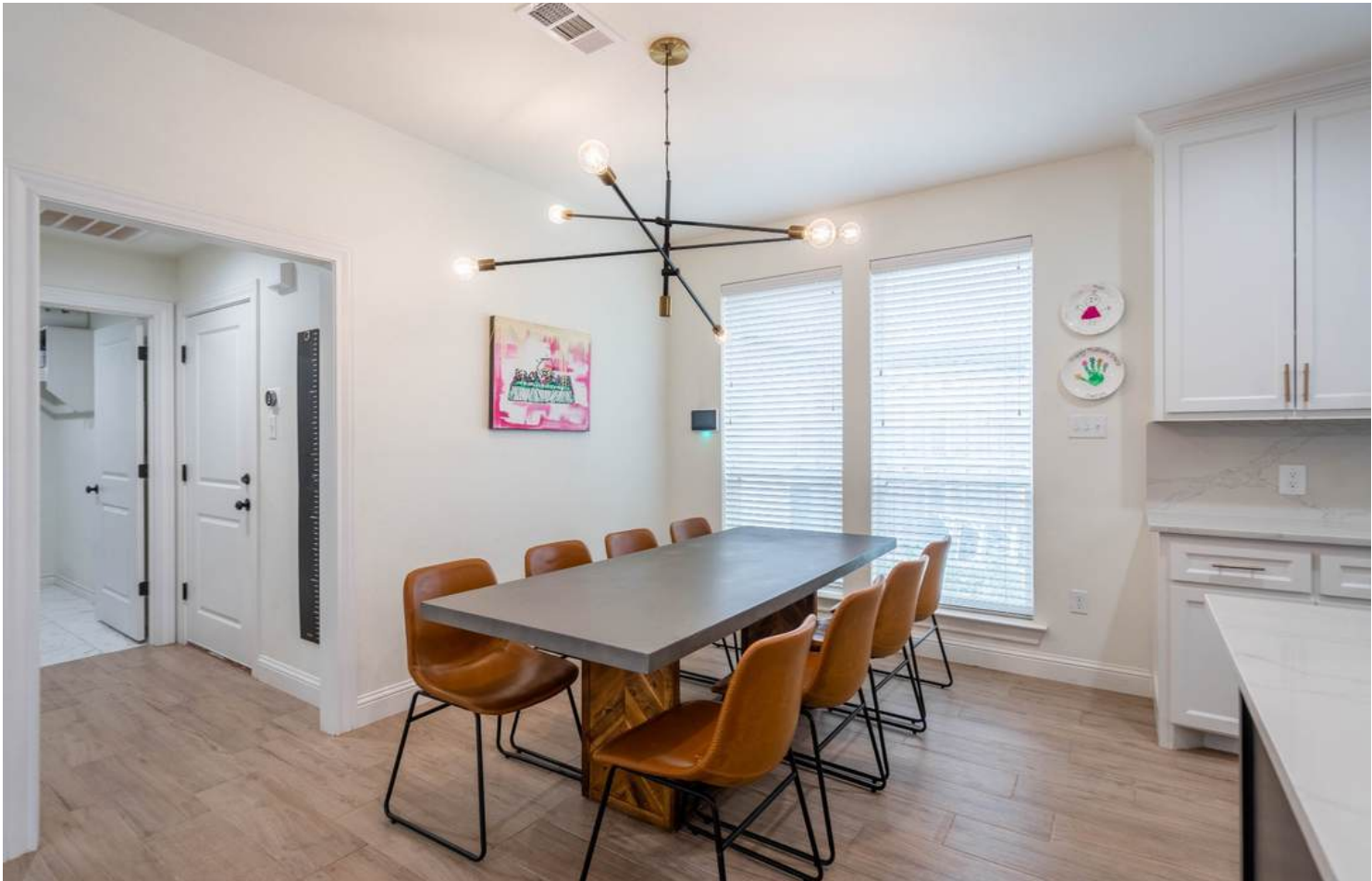
CAPITAL REALTY GROUP AT FATHOM REALTY