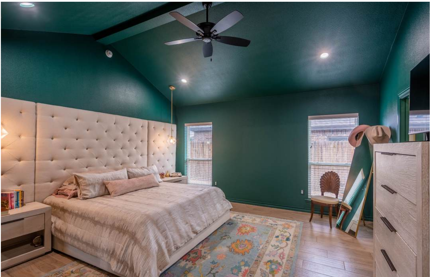
CAPITAL REALTY GROUP AT FATHOM REALTY