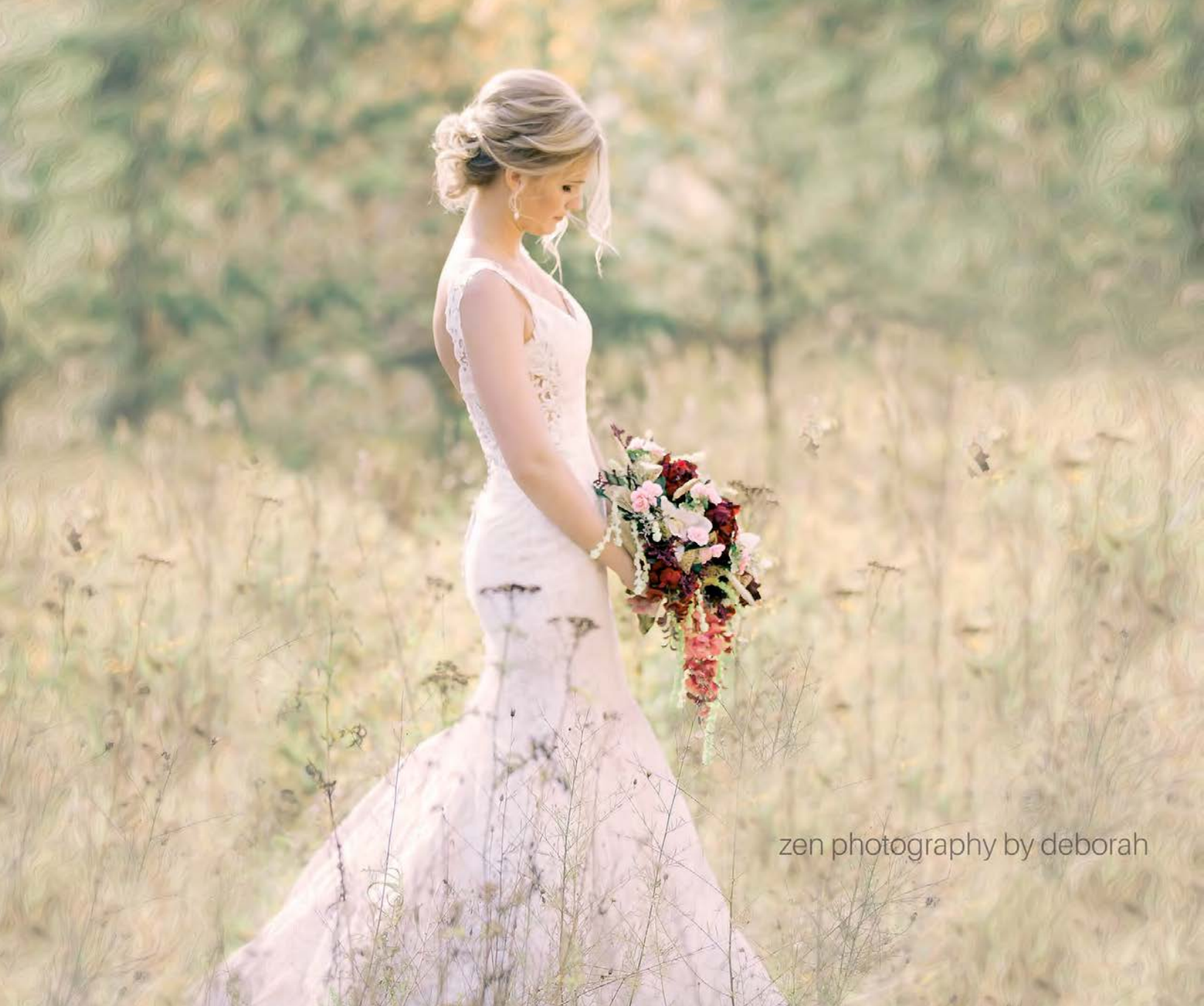
zen photography by deborah

After the dress was worn, the cake was eaten, the shoes were scuffed, the only thing you have left are the memories and enchanting photography that captures the moments of your beautiful wedding day.