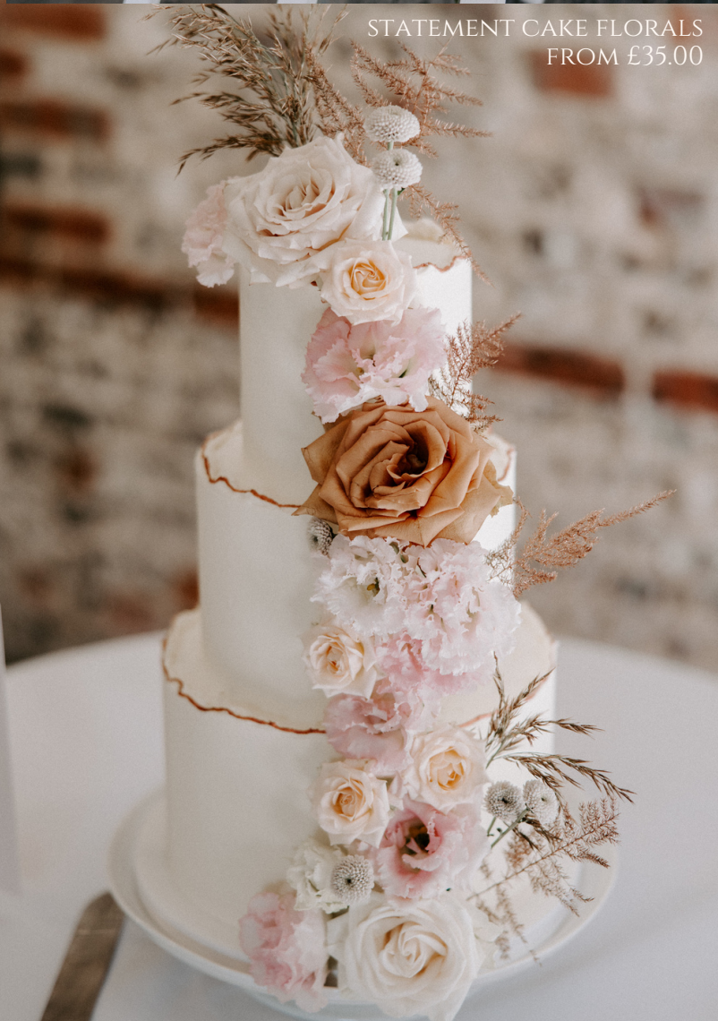
STATEMENT CAKE FLORALS FROM £35.00