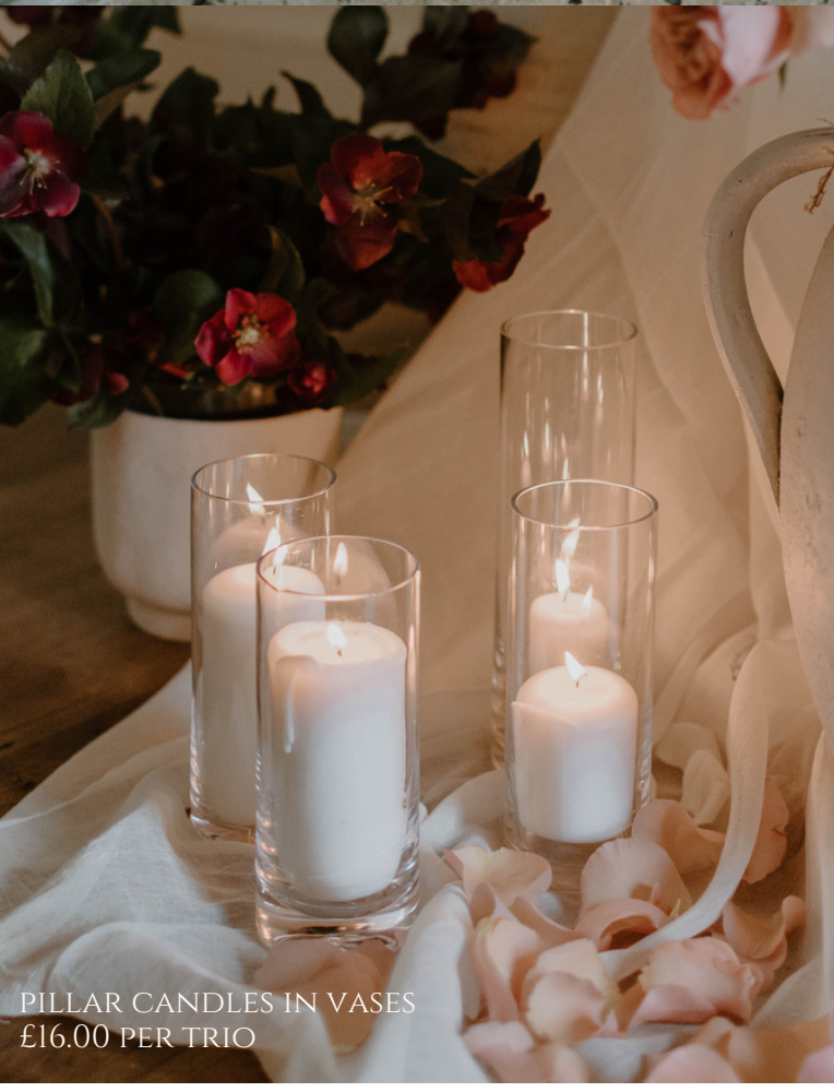
PILLAR CANDLES IN VASES £16.00 PER TRIO