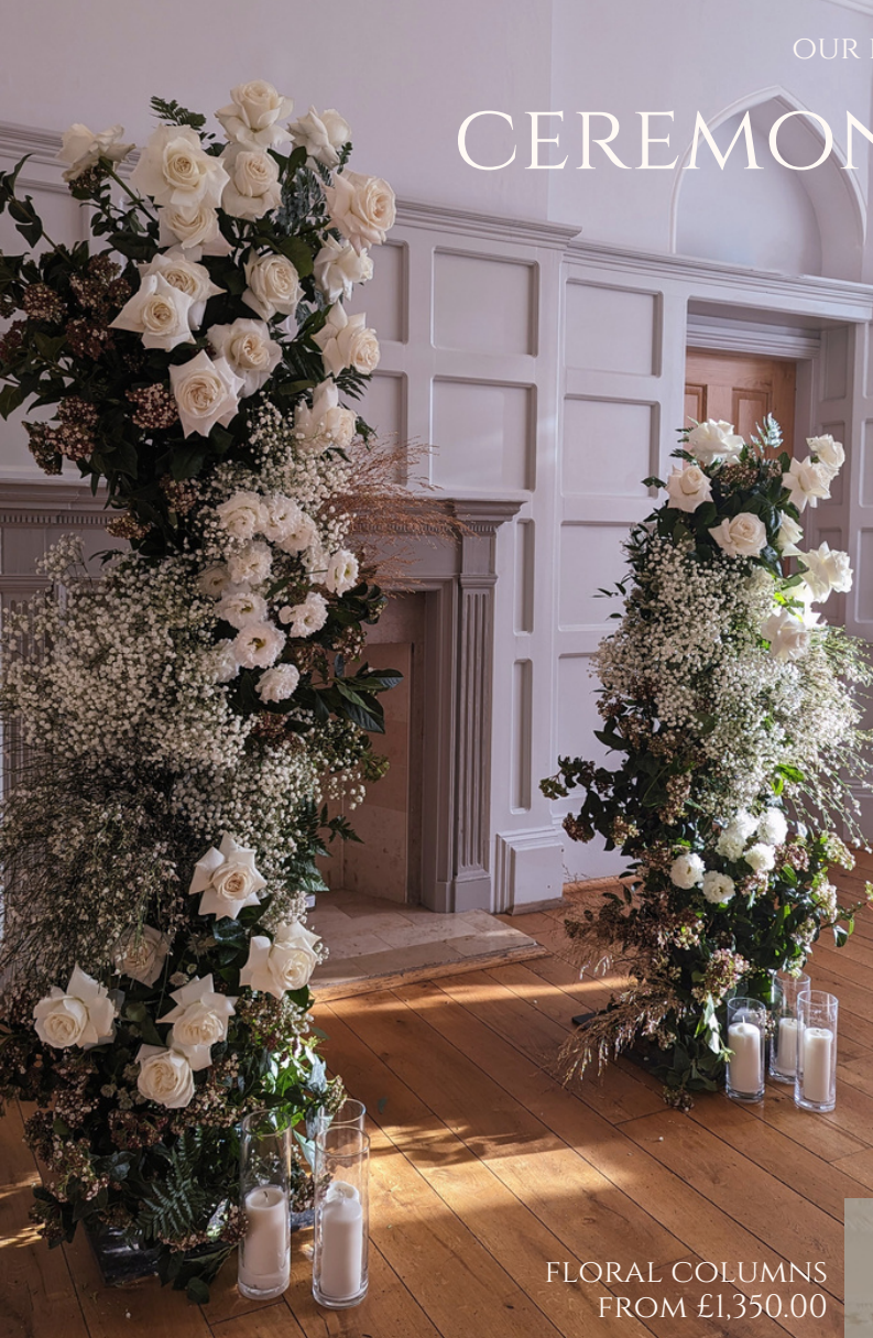
FLORAL COLUMNS FROM £1,350.00