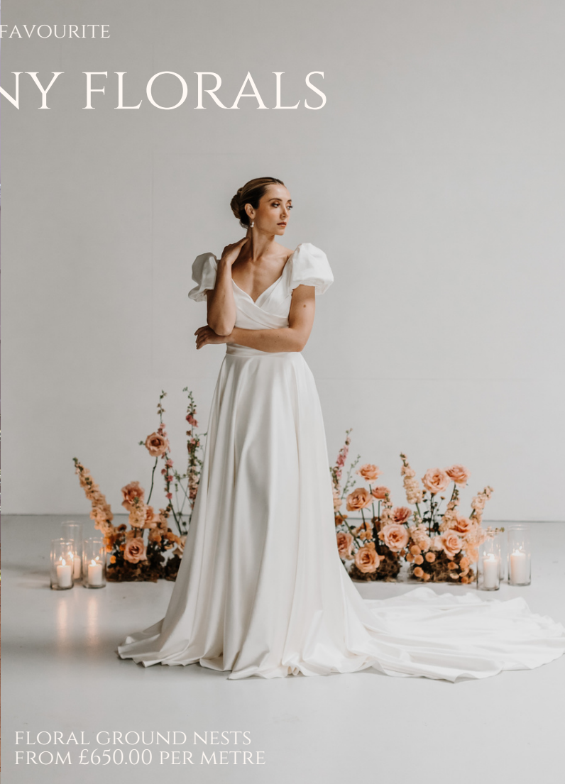
FLORAL GROUND NESTS FROM £650.00 PER METRE