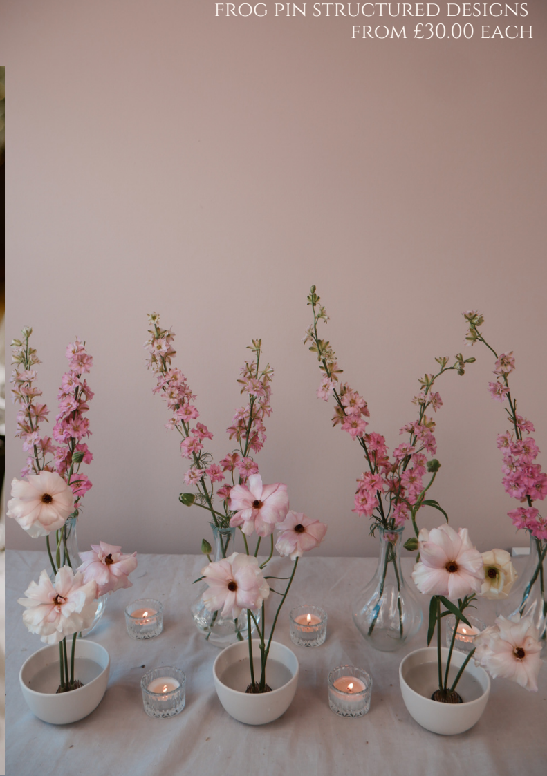
FROG PIN STRUCTURED DESIGNS FROM £30.00 EACH