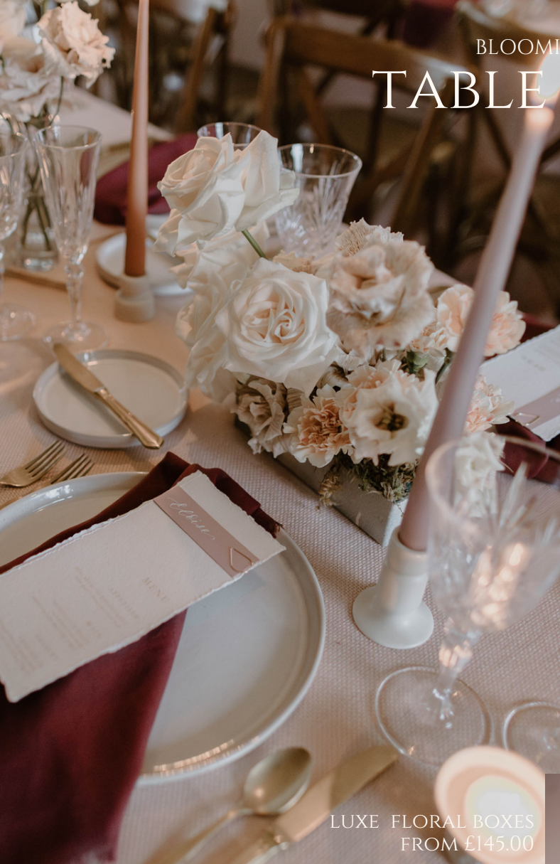
LUXE FLORAL BOXES FROM £145.00