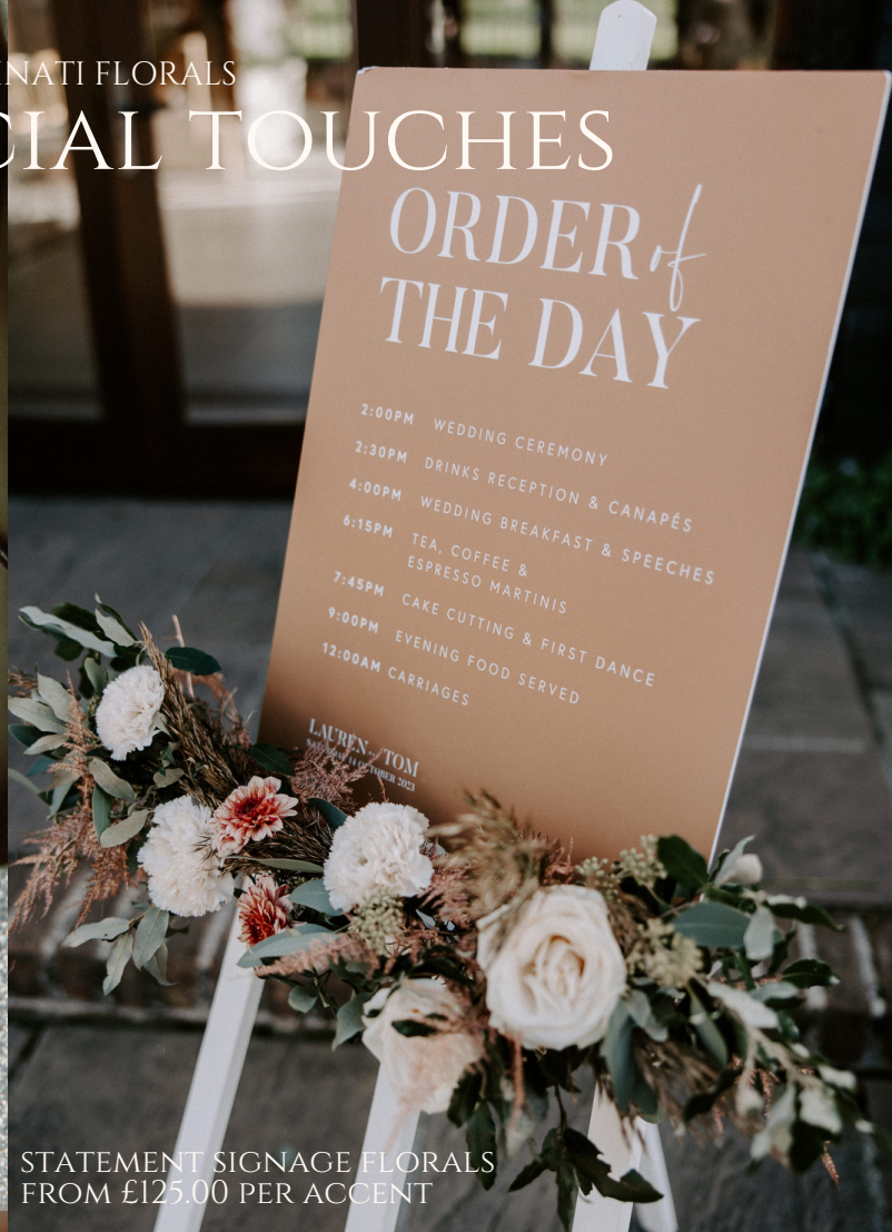
STATEMENT SIGNAGE FLORALS FROM £125.00 PER ACCENT