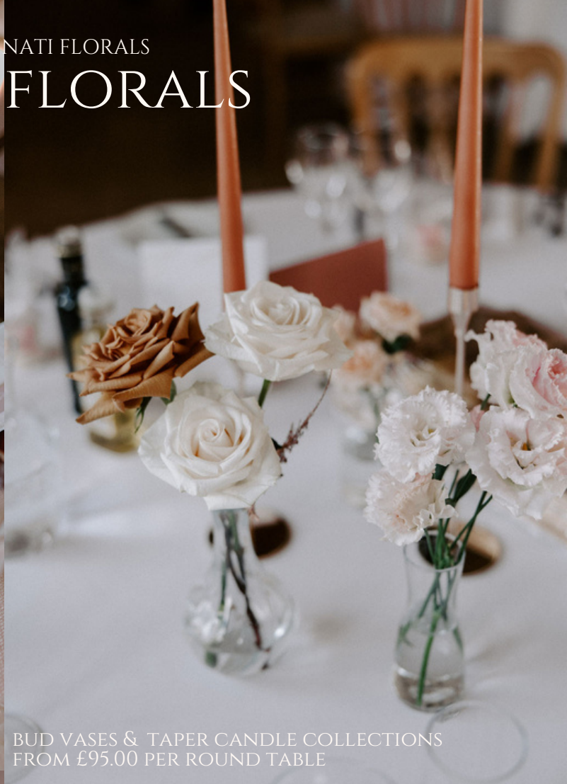
BUD VASES & TAPER CANDLE COLLECTIONS FROM £95.00 PER ROUND TABLE