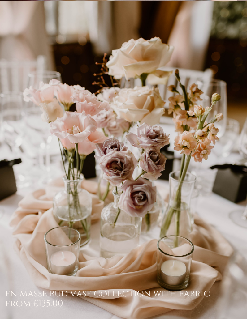
EN MASSE BUD VASE COLLECTION WITH FABRIC FROM £135.00