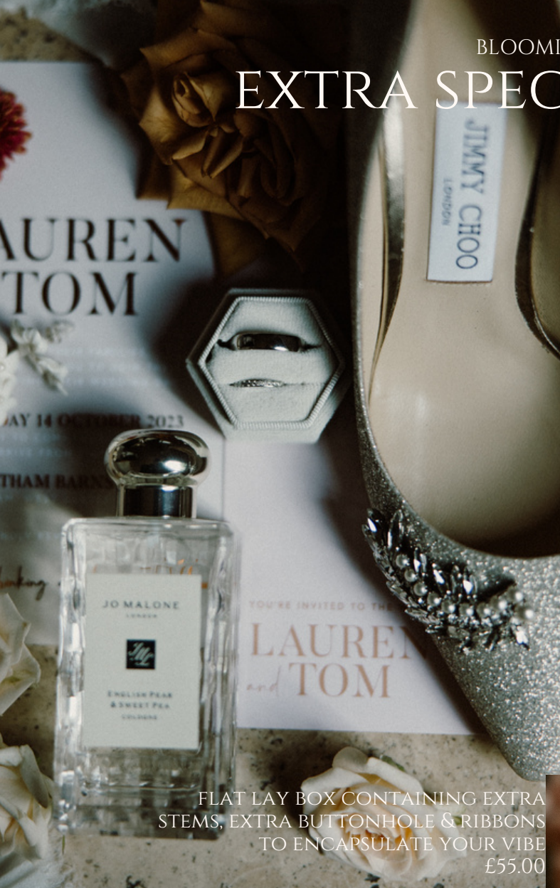
FLAT LAY BOX CONTAINING EXTRA STEMS, EXTRA BUTTONHOLE & RIBBONS TO ENCAPSULATE YOUR VIBE £55.00