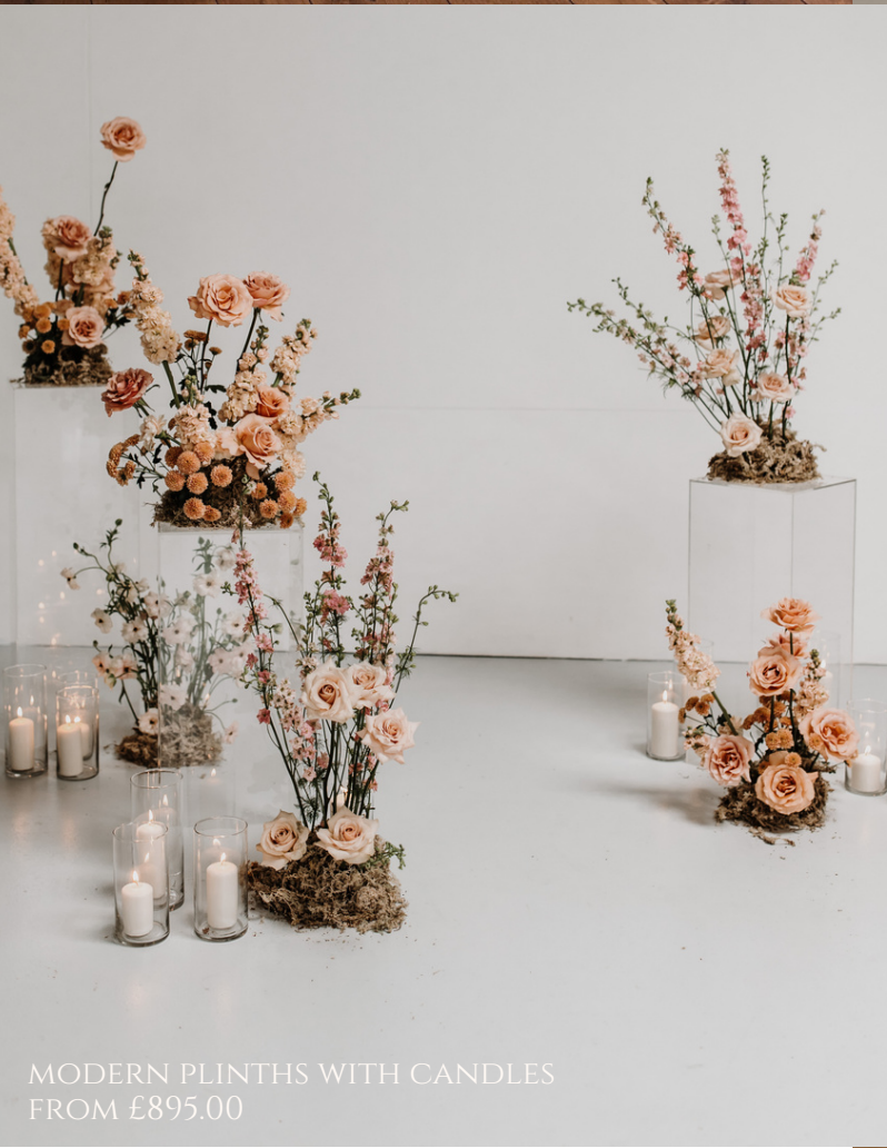
MODERN PLINTHS WITH CANDLES FROM £895.00