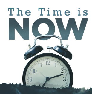
Discussion Questions Week 1