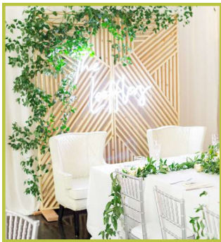
Wood Panel Backdrop