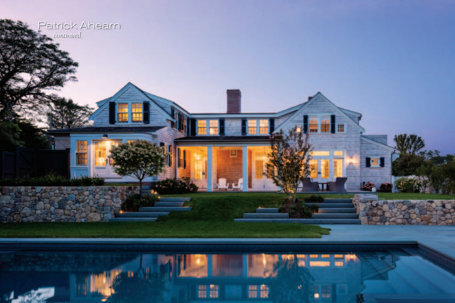
This 1870s Greek Revival home, historically known as the Josiah Nickerson House, had lived many lives in Chatham's Old Village Historic District. The house was once a family home, a summer rental, and even a nursery school. The design objective was to maintain the historical character and scale of this relatively modest antique farmhouse while meeting the homeowner's substantial new space requirements. The house (opposite page) presents an element of surprise; new visitors have no idea the home is right on the water until the front door opens. Staircases (below) in historic homes can become finely detailed architectural elements to savor, rather than hide away.