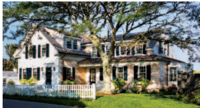
A traditional shingled style home (top) in the reimagined New England vernacular. Two of Ahearn's classic New England styled homes (above) on Cape Cod and the Islands.