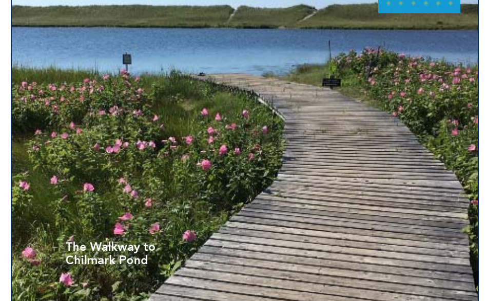
The Walkway to Chilmark Pond

Best of the Vineyard 2017 Martha's Vineyard Magazine