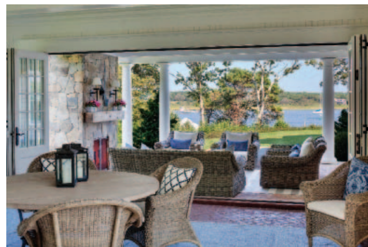
A two-way fireplace (top) in the outdoor kitchen offers a link between the pool and the bocce court. All Ahearn designs (above) pay particular attention to the relationship between the indoor and outdoors. The kitchen (opposite) employs timeless materials and traditional spaces including a butler's pantry and wet bar.

that perhaps an architect's greatest achievement is making a neighborhood work better and no one notices, "where the architect comes in as the ghost in the night."