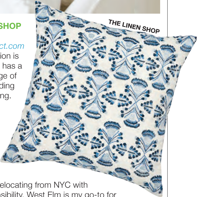
THE LINEN SHOP