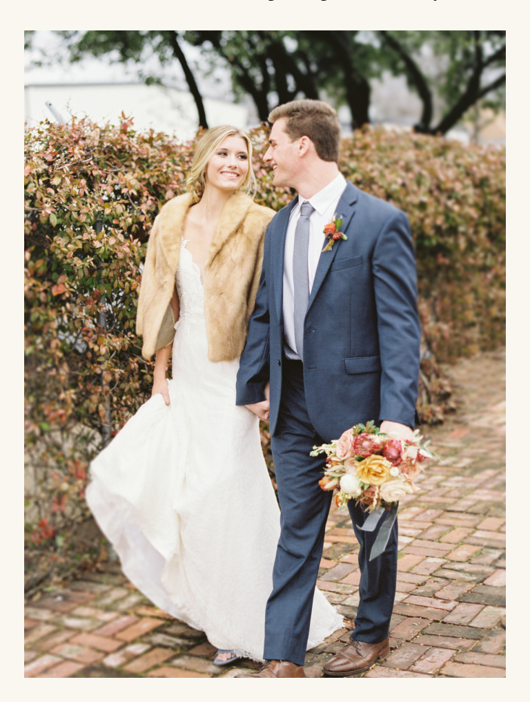
LAUREL & SAGE florals

Not all vessels are created equal in their ability to hold flowers, and to ensure that we can provide designs in our L&S style, we don't allow you to provide your own vessels, however, we do offer multiple options for you to choose from.