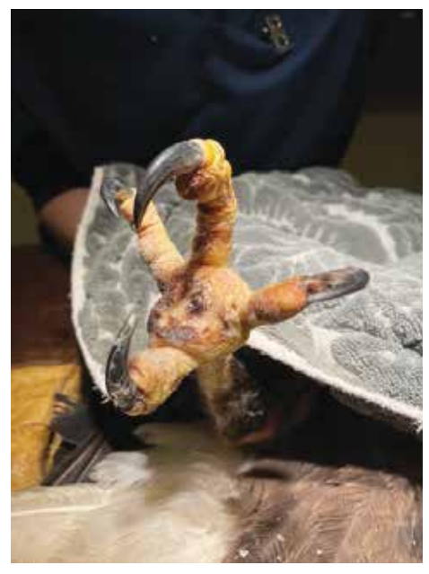
After weeks of treatment, the lesion had resolved completely.