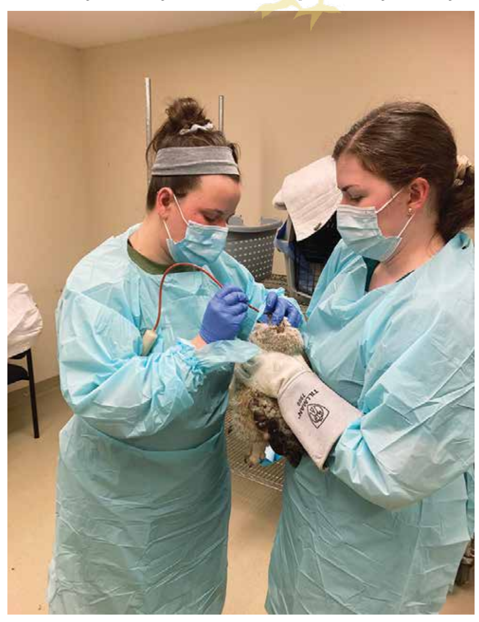
Though AI can be zoonotic, there have not yet been any human cases associated with the 2022 HPAI outbreak. That said, individuals working with poultry or any birds should exercise caution to protect themselves and their birds.

made to our biosecurity protocols as we do our best to avoid a worst-case scenario. Shoe sanitizing stations have been placed at every doorway and all avian patients are screened prior to entering the building.