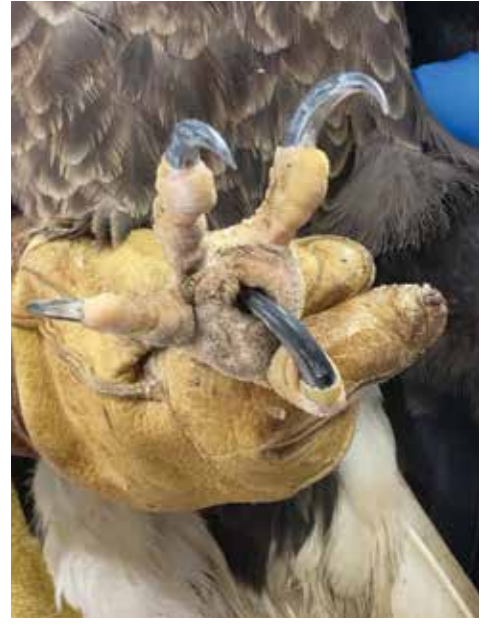
When the bird closed its talons, the hind toe would puncture into the lesion.