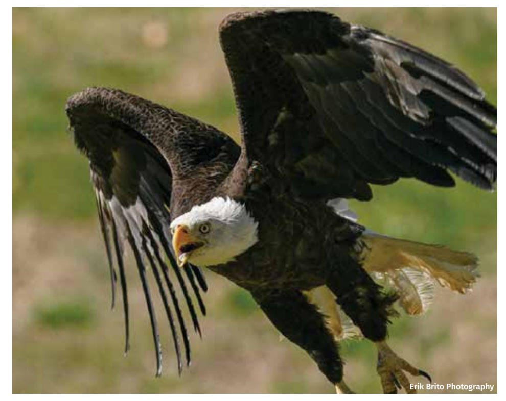
After recovery, this Bald Eagle was successfully released back to the wild.