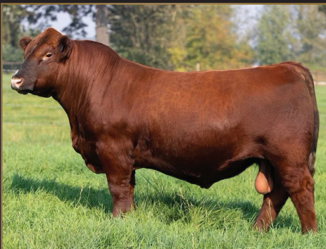
MHC REXYN J305