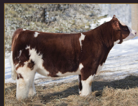
MAN AMONGST BOYS