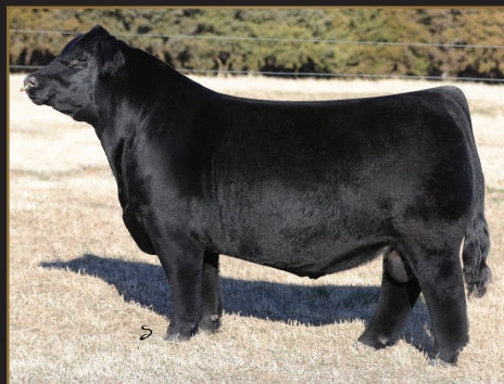
SOMETHING ABOUT MARY (SAM)