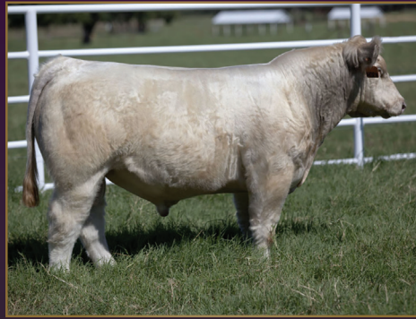
BUSINESS DONE RIGHT