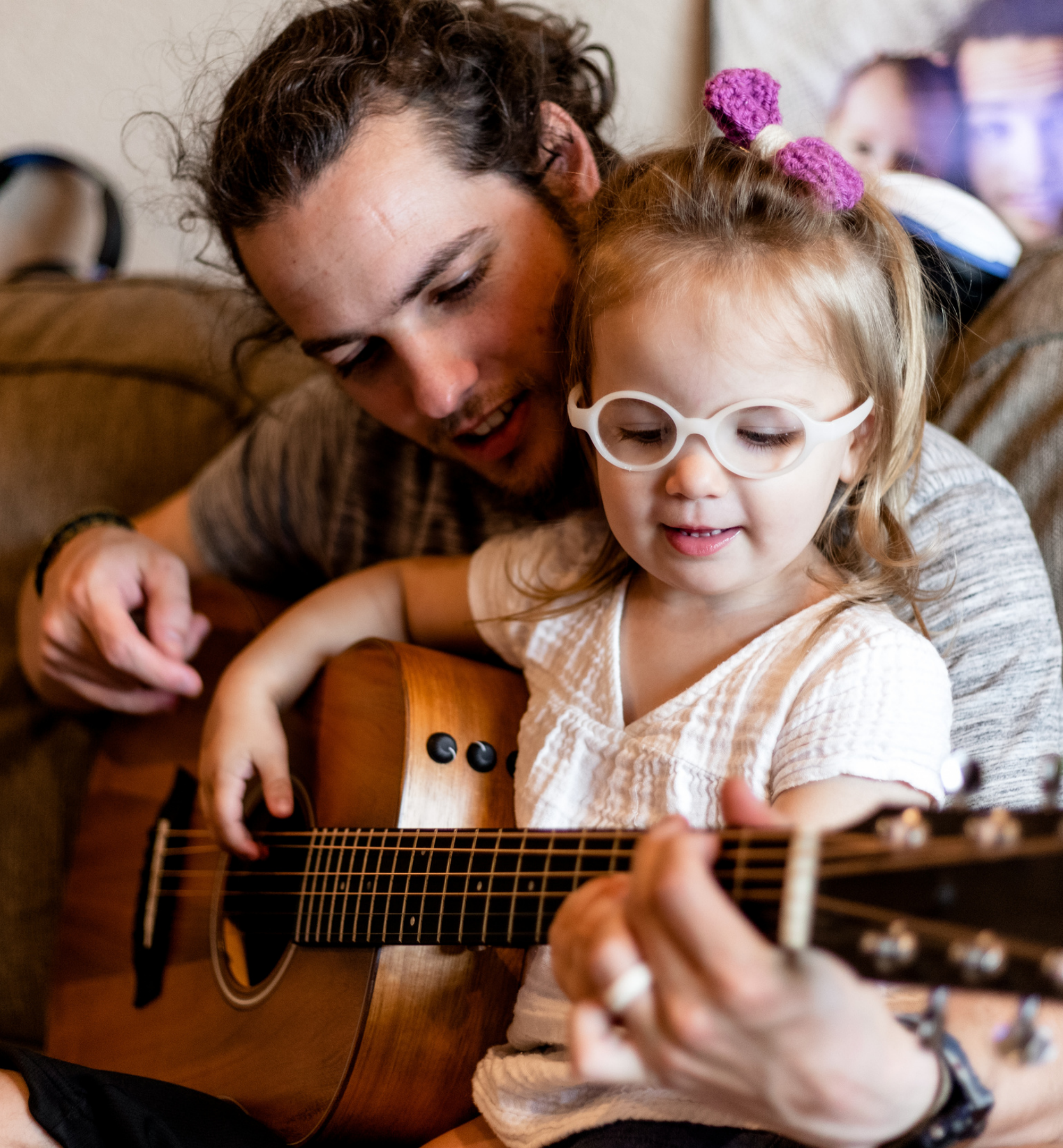
Photo sessions don't have to be stressful, they don't have to be posed, and they don't have to be boring. My goal with the creative sessions is to encourage you to interact and create real memories. From game nights to smores to bowling to creating music to picking out a Christmas tree - nothing is off limits and everything is encouraged. Gather the people you love together and make memories. Then let me tag along so that you have pictures to relive it all again and again and again.