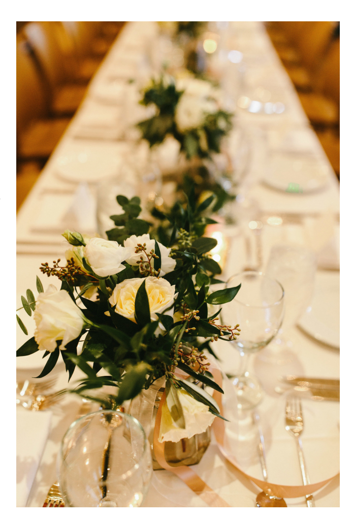
Investment Starts at: $1,300