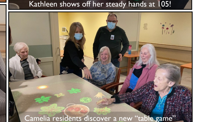
Camelia residents discover a new "table game"