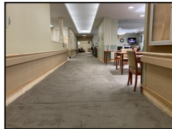
The look as the old carpet and linoleum are removed.