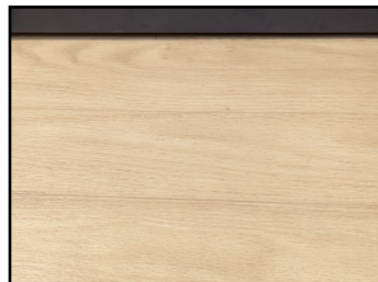
A sample of the new vinyl plank flooring.