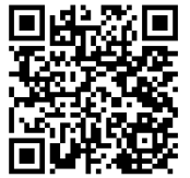
Read Aloud Video

Here is a little background information about our First Chapter Friday title and its creator. Feel free to add your own notes and thoughts in the bottom box.