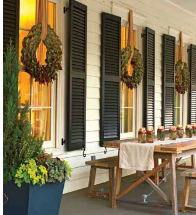
An industrial farm table with a burlap runner down its center offers a spot for casual holiday meals. Float sprigs of spruce and cranberries in Mason jars, and top them with votive candles for an easy, double-duty centerpiece.