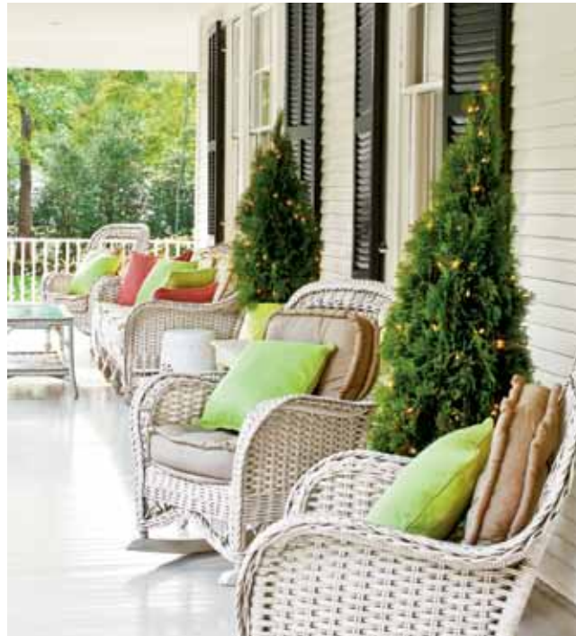
A comfortable side porch serves as a summer sitting room in warm weather. At the holidays, potted cypress trees wear a layer of sparkling lights and serve as miniature Christmas trees. Lime green throw pillows pop against the wicker furniture and enhance the seasonal feel.