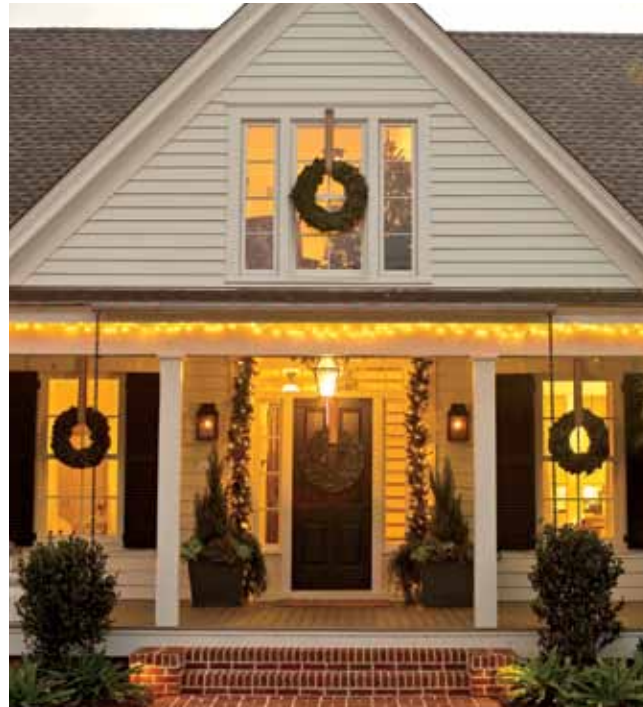
Wreaths at the windows, a lit garland outlining the front door, and a simple strand of lights under the eave give the front porch of this farmhouse a cheerful glow.