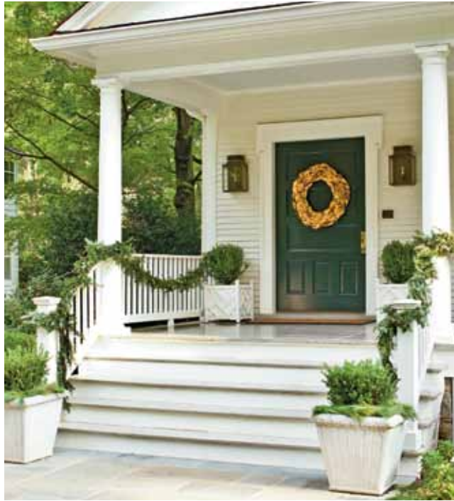
A wreath of gold magnolia leaves gleams against the black-painted front door, while swags of fir garland outline pretty porch railings. Simple potted boxwoods get dressed up with a skirt of pine boughs.

Include your porch in the holiday fun to fashion an outdoor room for party spillover.