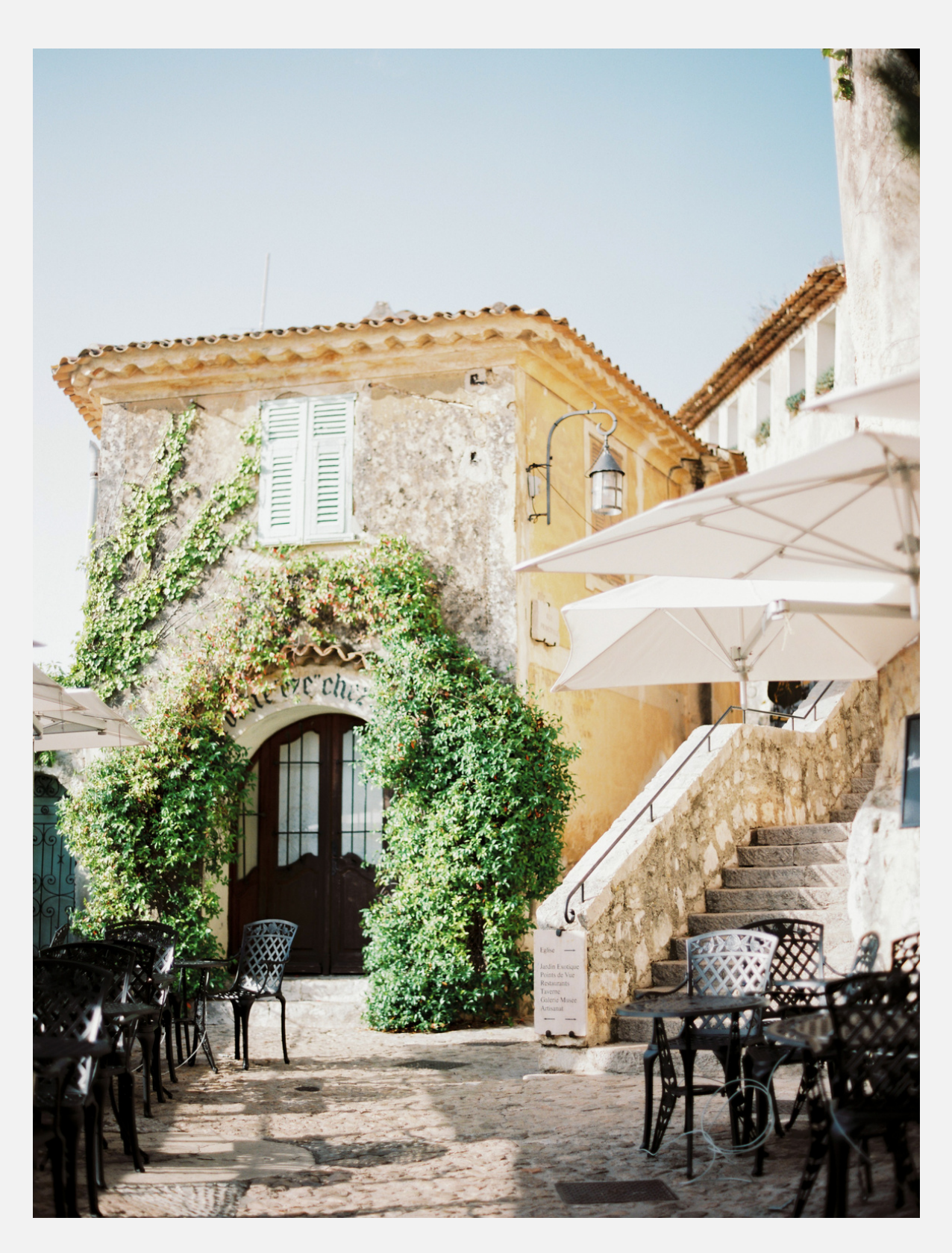
Eze, France - Contax 645 | Fuji Pro 400