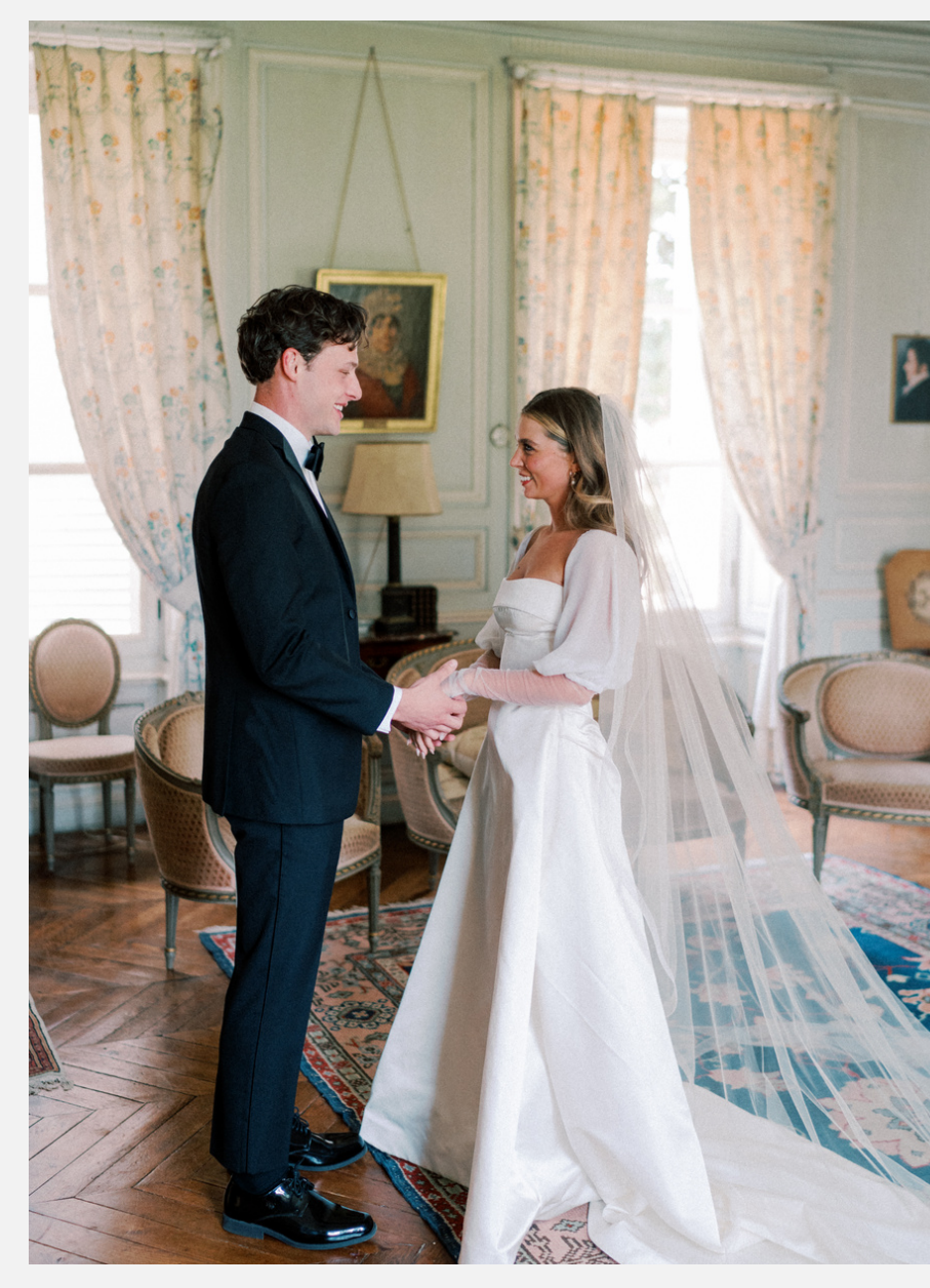
Château de Bouthonvilliers, France

The first look is also an amazing opportunity to exchange your personal vows if you don't feel like sharing them in front of everyone during the ceremony.