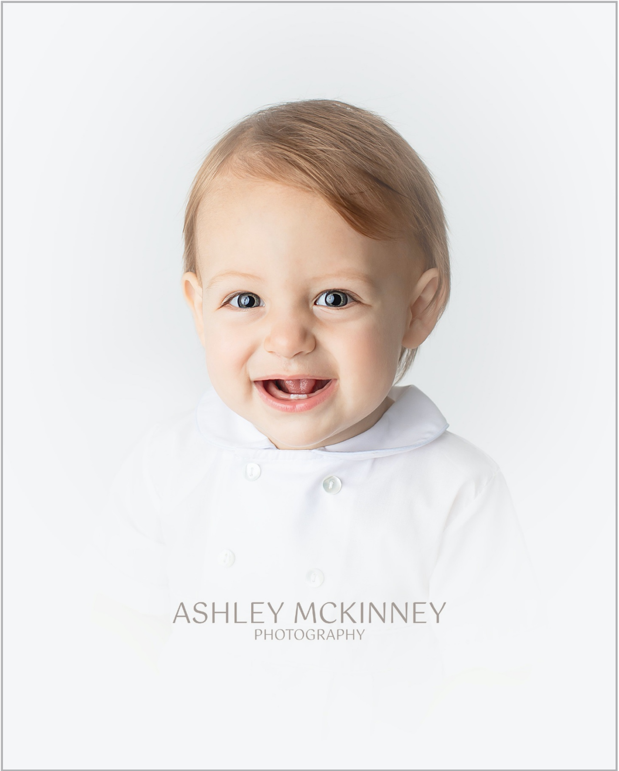
ASHLEY MCKINNEY PHOTOGRAPHY