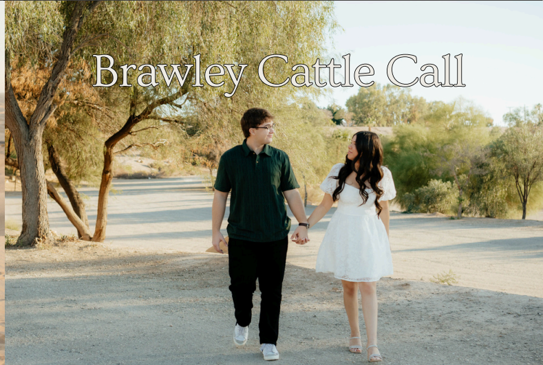
Brawley Cattle Call