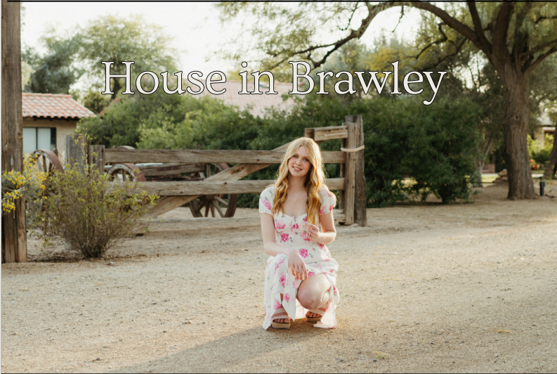
House in Brawley