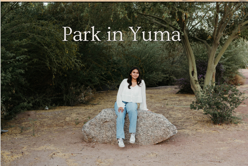
Park in Yuma