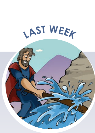
God preserves Israel Exodus 15:22-17:7

At Mt Sinai God once again announced His intention to have a people who would represent Him and be His own people, a kingdom of priests and a holy nation. This remains God's plan today: every person He calls, whether Jew or Gentile, is called to dwell in a relationship with a holy God and to proclaim Him to the world. The law given at Sinai shows God's holiness, and Christ's death on Calvary satisfies His holiness. And now, Christ's risen life is able to turn sinners into a holy nation.