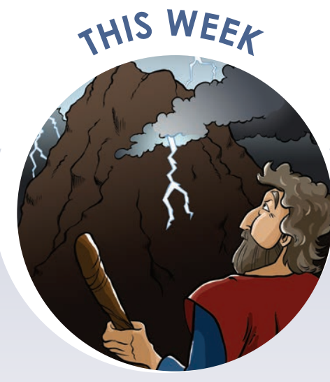
God prepares Israel for the covenant Exodus 19:1-25