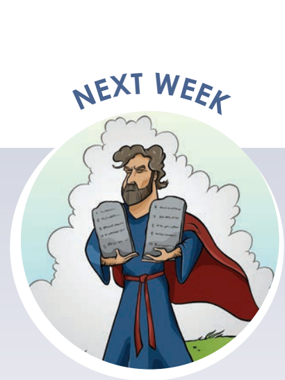
God gives the Ten Commandments Exodus 20:1-21