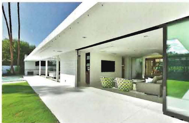
(LEFT) A WALL OF IVY BREAKS UP THE STARK LINES OF ARCHITECTURE. (RIGHT) FLOOR-TO-CEILING GLASS WINDOWS MAKE IT ESPECIALLY IMPORTANT TO CARRY THE INDOOR AESTHETIC TO THE OUTSIDE.