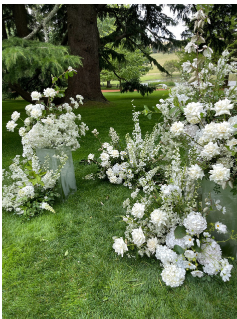
NEST / DECONSTRUCTED BACKDROP