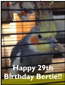
Happy 29th Birthday Bertie!!