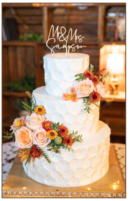
Wild Irish Rose Photography