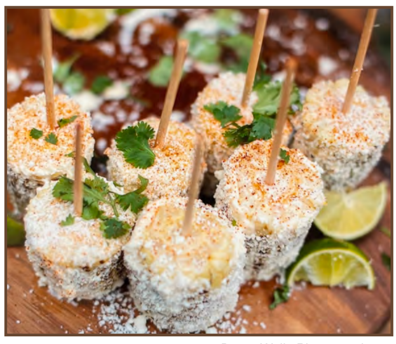
Tacos & Beer Catering