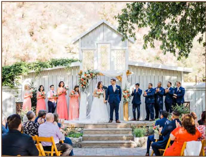
Wild Irish Rose Photography

Start time may be earlier. End time may not be extended.