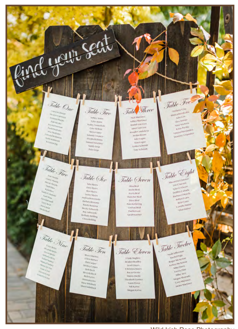
Wild Irish Rose Photography

Sales tax IS included. We have NO Service or Corkage Fees. Gratuity has NOT been added.