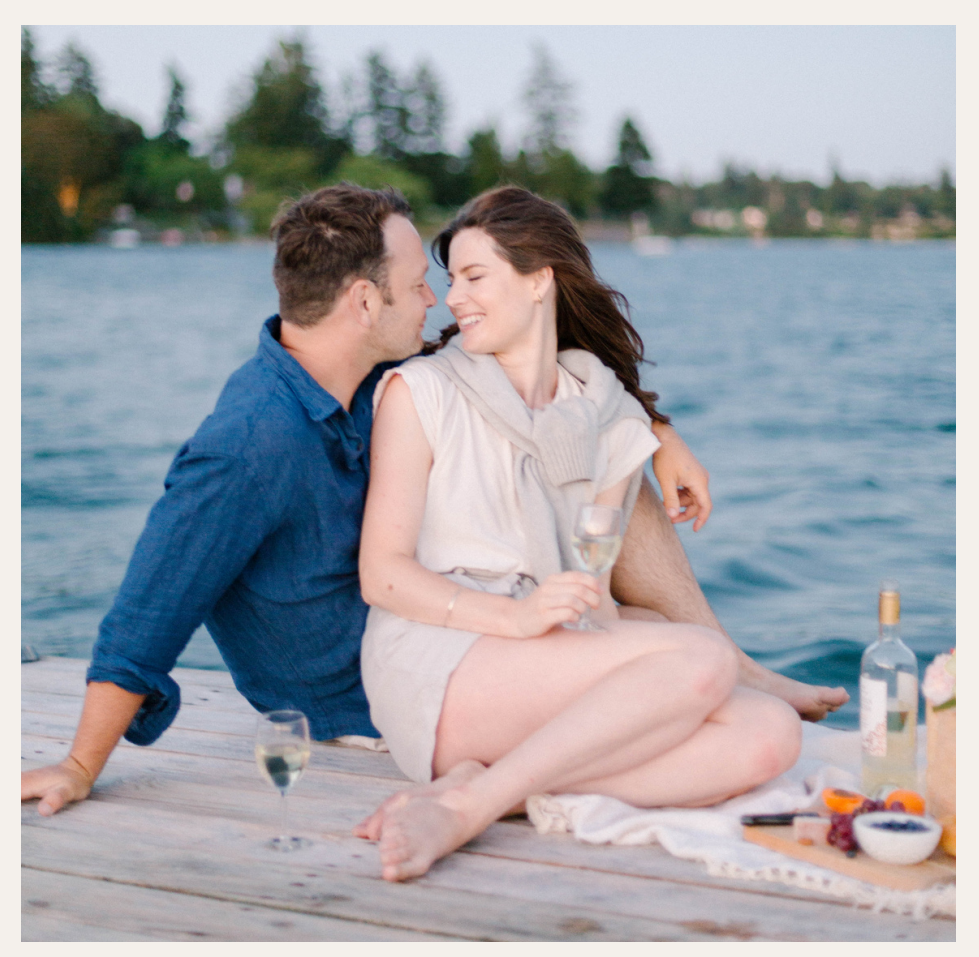
No. 3 Choosing Your Outfits

One of the biggest struggles that couples come to me with is: "What do we wear?" We've all been there, standing in front of our closet, clothes strewn across the bed and floor. I see you! The first step is to ask yourself, "What makes me feel amazing in?" Comfort is key here. If you don't feel comfortable in what you are wearing, it'll show through the images. Pick pieces that flatter you in all the right ways and always bring two outfits; one formal and one casual. This will give you more options for those Save-the Dates. Not quite sure an outfit will translate through photos or pair well with what your partner chose? Reach out! I am more than happy to give advice if you need it.