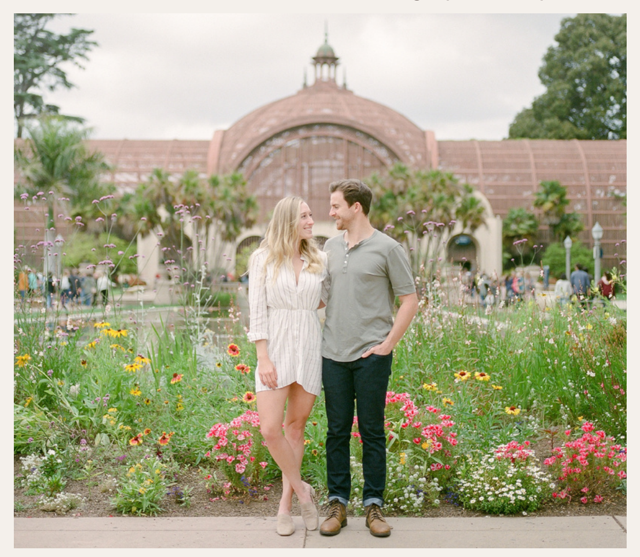
No. 1 Book Your Photographer Early

This seems like the most obvious tip but most couples wait a while before doing the photographer search. The bad news? A lot of photographers, myself included, tend to book out a year in advance and have key weekends during the good weather months already booked. The earlier you book your photographer, the better!