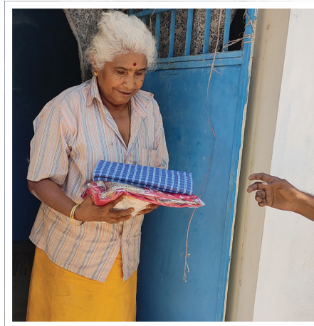
Saree Distribution in Sai Aashraya Adarsh Gram

spread all around and brought joy to all of us. New Clothes were distributed along with the Monthly Provisions to all the people who were overwhelmed by the Love and Dedication of the volunteers. It was so much fun and also very moving to see the Grandmothers discuss the colours of the Sarees they received. One of them jokingly said to the other "You are so old and preparing for the last days of your life but you are still so particular about the colour of your Saree" The expressions on their faces were simply priceless.