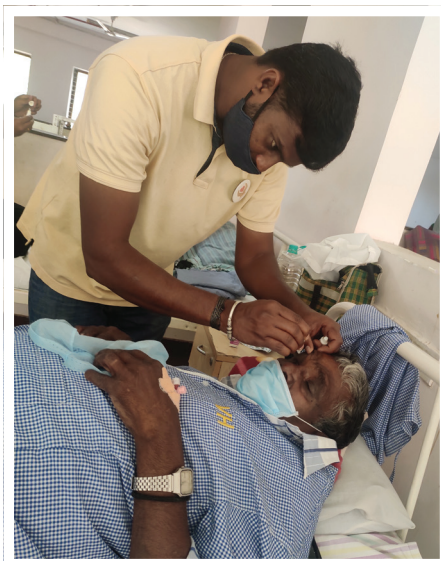
Loving post operative care

The people of Sai Aashraya Adarsh Gram have bestowed upon us the great opportunity to serve them and discover our true selves and we take this opportunity to convey our Heartfelt Love & Gratitude to them. We are sure that in the wonderful times to come, we will do our best to serve the people of this village and everywhere else in the best way possible and touch many more lives through Love expressing itself as Selfless Service.