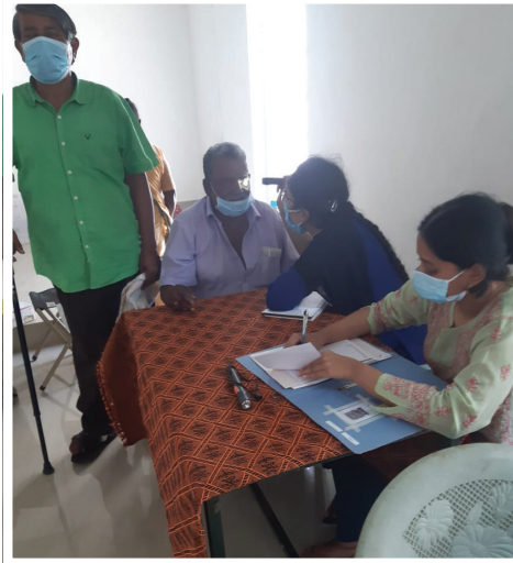
Ophthalmology Screening in Sai Aashraya Adarsh Gram