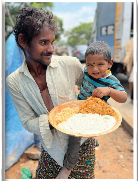
Bangalore Cantt Porters & Housekeeping Staff Partaking Lunch

the schools resume. The Teachers have been saying that the Breakfast Seva will be a vital activity which will draw students to the school after the long Covid break from regular schooling. As the pandemic related restrictions further ease, we anticipate and pray that our Breakfast Seva Project will also resume soon.