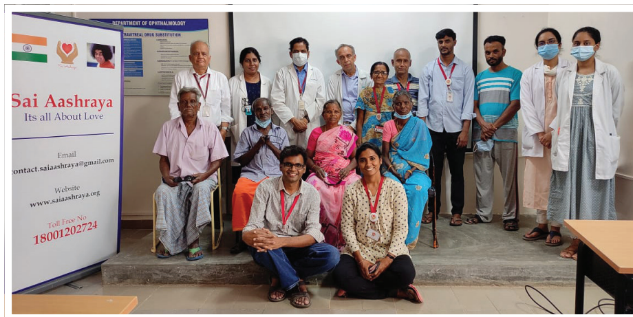
After a Successful Cataract Operation - With Team Sai Aashraya & The Staff of The Dept of Ophthalmology, Vydehi Institute of Medical Sciences

Throughout their stay in the Hospital, our volunteers took turns to be with the loving elders round the clock helping them with their daily routine as well as keeping them pepped up. One of them introduced a couple of Volunteers to another patient saying, "These are the people looking after us. They are the only people that we know. They are verily like God for us." The conversation between the patients moved us to tears. One other Grandmother said that all their sadness