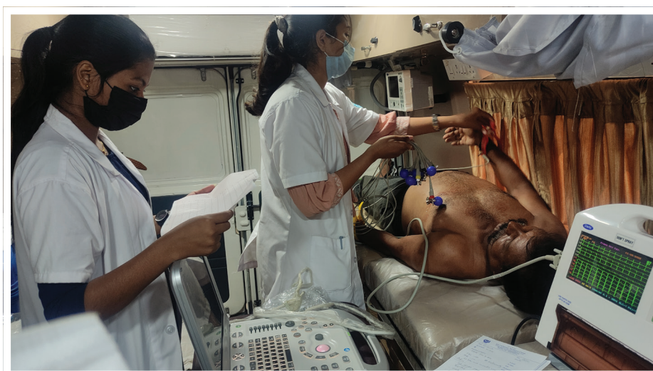
Cardiac screening in progress at the construction site

progress of the Project and have offered their support in all ways possible and conveyed their wishes and commendations to Team Sai Aashraya. It is also amazing and overwhelming to see the number of Pride-of-the-Nation companies, both Public and Private, joining in Sai Aashraya's mission of Love & Service through the Corporate Social Responsibility (CSR) initiatives. The past few months have seen more companies and people join us this way. They are truly moved by what Sai Aashraya has been able to achieve by touching the lives of thousands of people living in the most under-served, diverse and challenging locations.