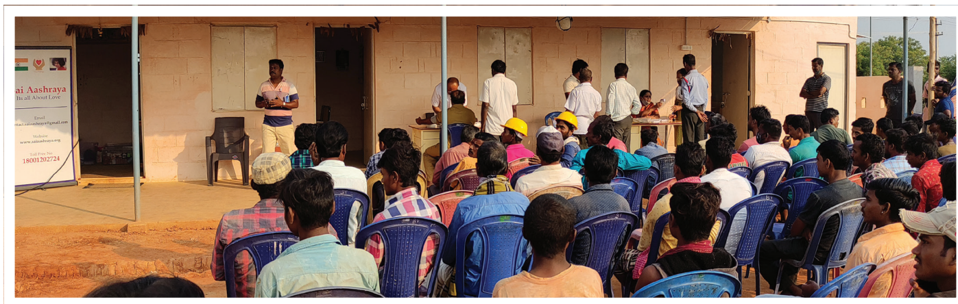
Medicare Camp In Kolar

readers, you will be happy to know that, from Steel to Cement to Medical Equipment to Furniture and Fixtures, ... every screw and nail, used in the construction of this hospital, is of the highest quality, by intent.