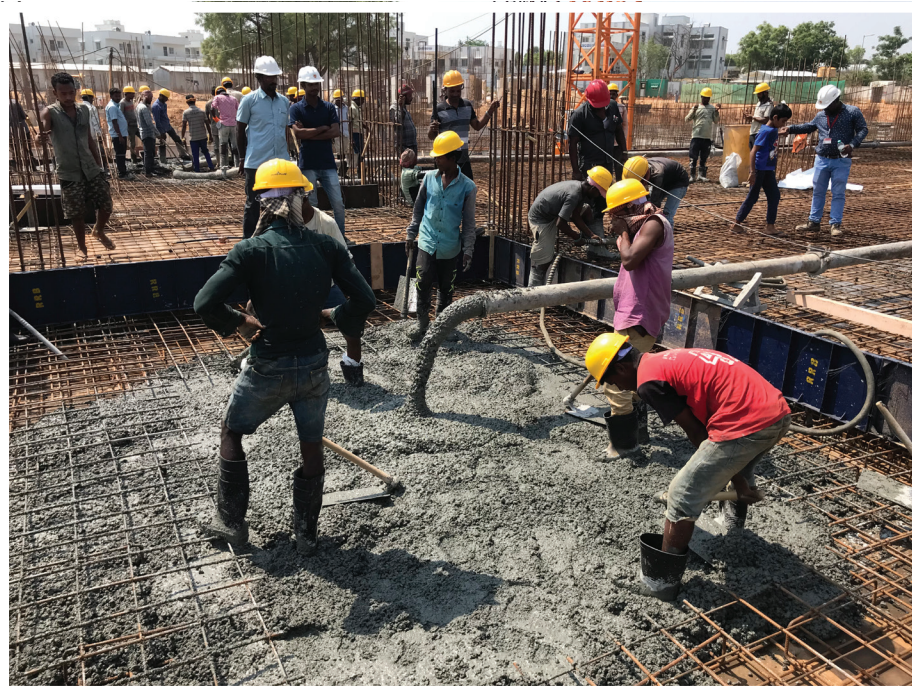
Commencement of Concreting work for the Ground Floor

From the start of the new year, there has been tremendous momentum in the construction of Sai Aashraya Super Speciality Hospital. With perfect weather conditions for construction, the foundation work of the Hospital has now been completed and the basement floor has also been built. Work on the ground floor is now making rapid progress. By the time the next edition of our newsletter is out, we will see the ground floor ready. Dear readers, for all of us in Sai Aashraya it was indeed overwhelming when we saw the foundation work complete and slowly before our eyes the foundation was covered with all the earth from the backfilling. Now with the basement built and the ground floor taking shape, the foundation is now a precious memory etched in our hearts forever.