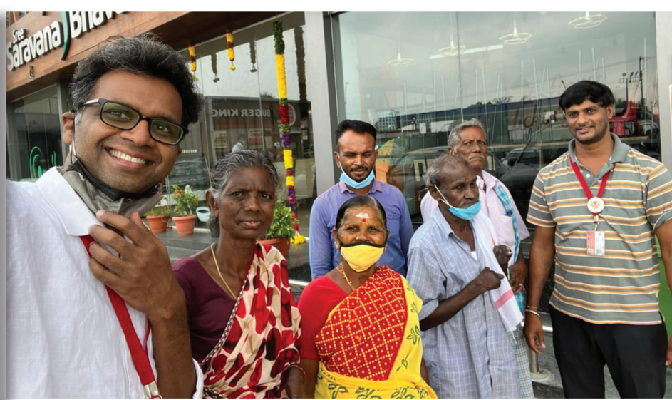
Selfie after Breakfast & Coffee enroute to Sai Aashraya's HQ