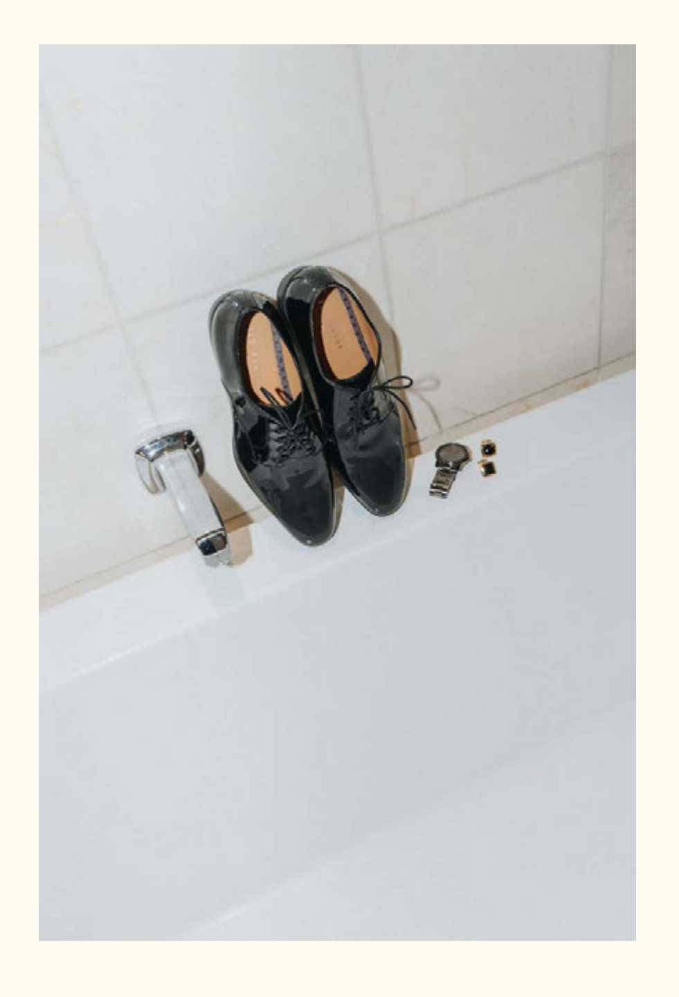
CUSTOMIZE THE PERFECT DOCUMENTATION FOR YOU