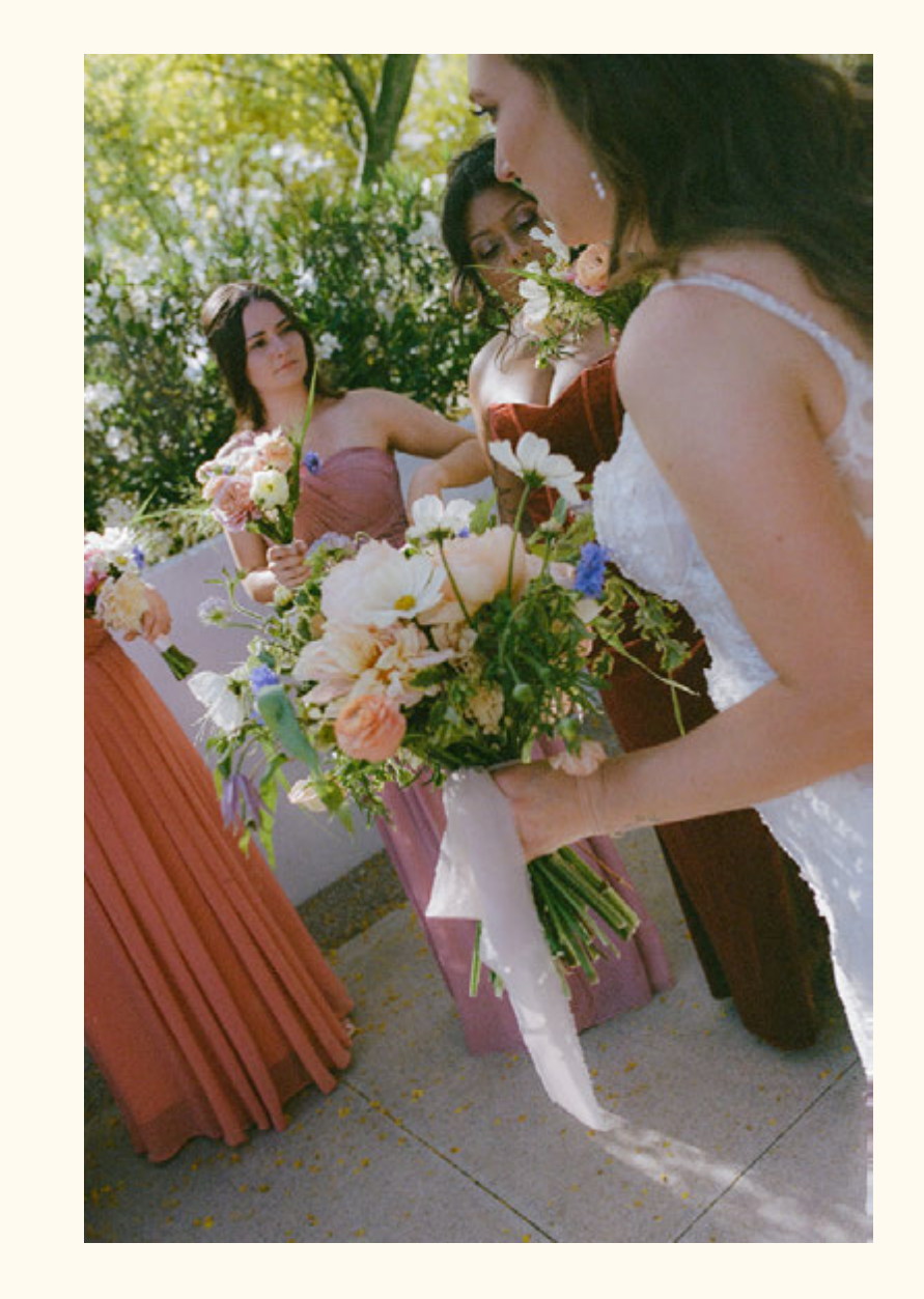
CANDID ORGANIC DETAILED ENERGETIC