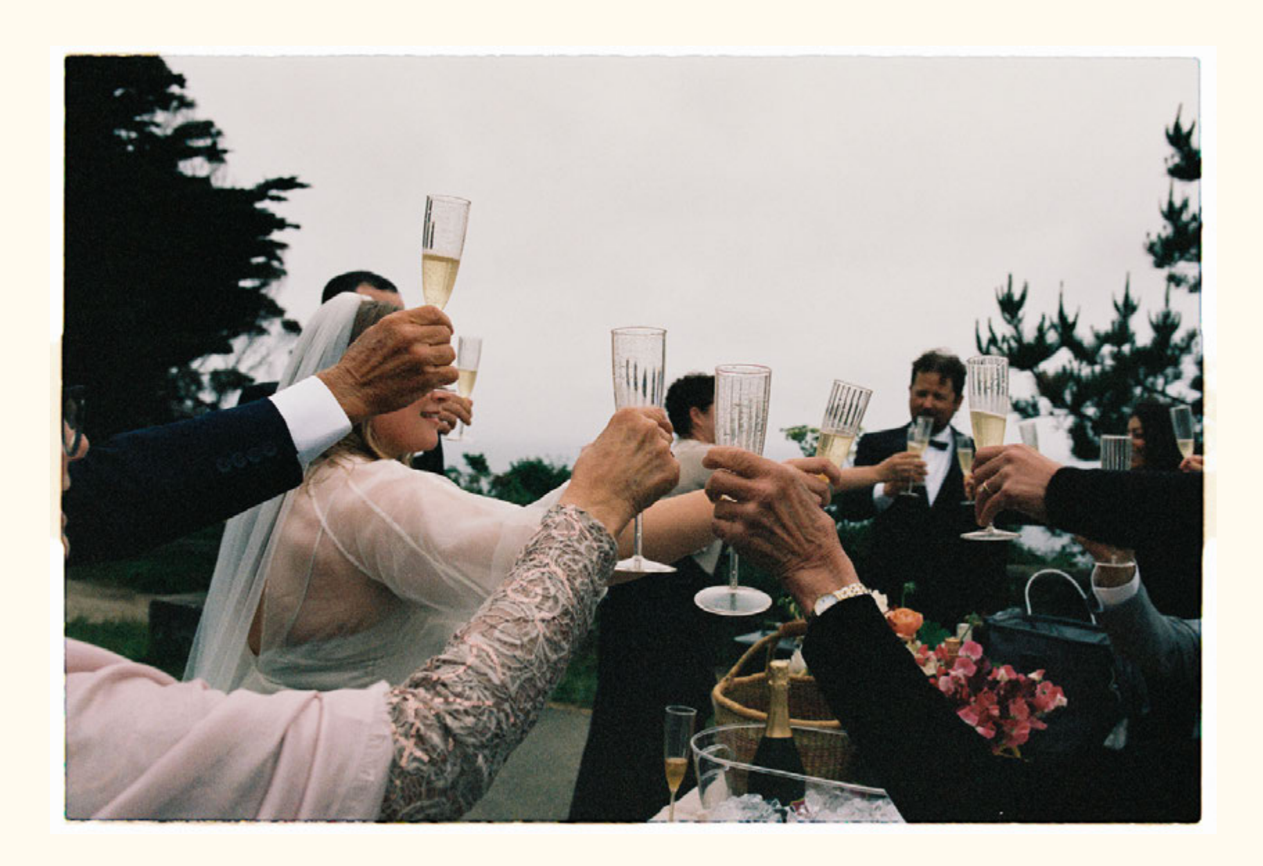
*check "add-ons" for customization