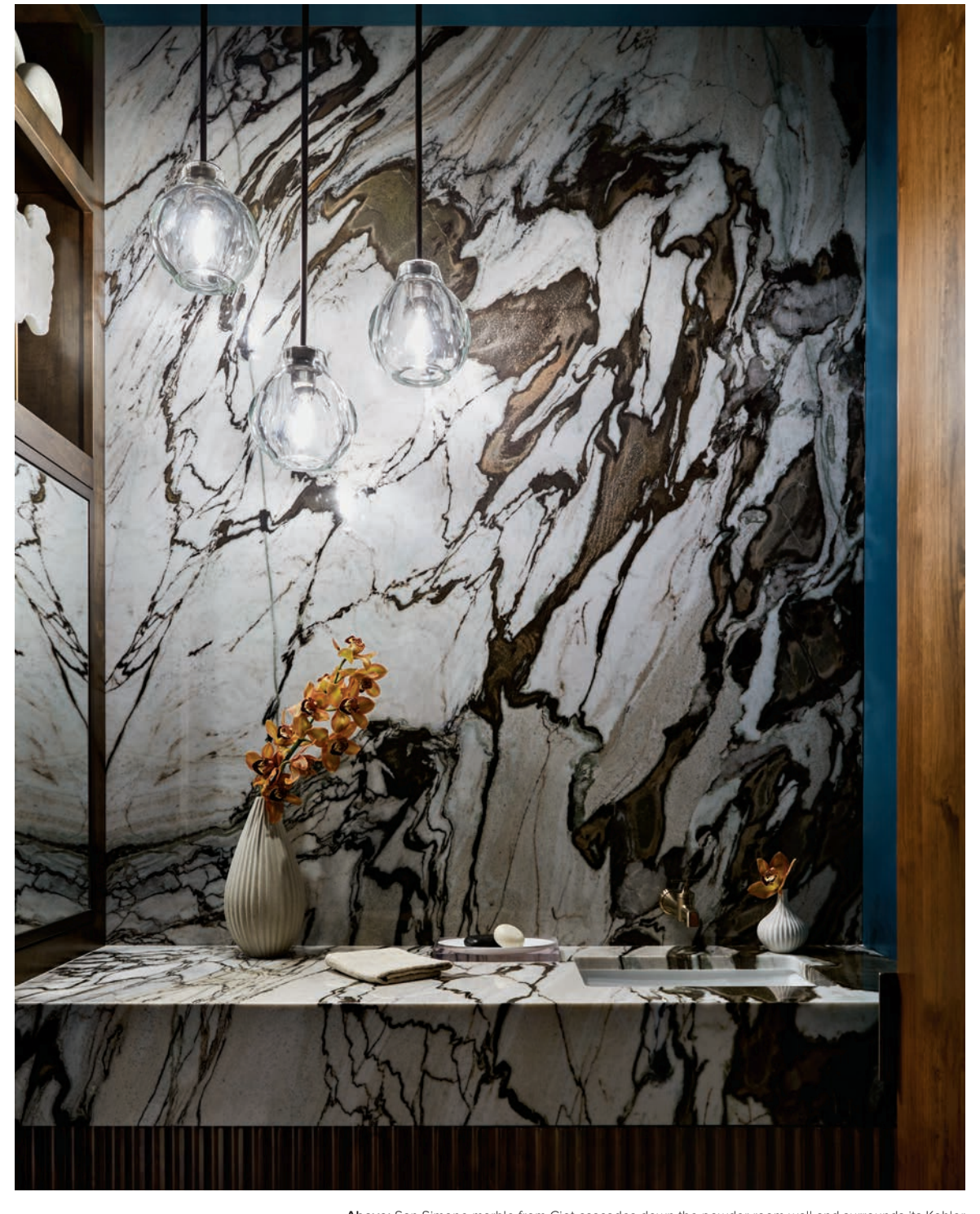
Above: San Simone marble from Ciot cascades down the powder room wall and surrounds its Kohler undermount sink, which also features Brizo's Levoir faucet. Instead of hanging in the expected spot above the sink, the mirror is integrated into bespoke cabinetry by Americraft, Inc.

Opposite: Extra-fine arrowroot grass cloth by Phillip Jeffries lends tactility to the walls of the study, where Eames lounge chairs by Herman Miller flank Wildwood's Homer Lamp atop Bernhardt's Benson Side Table. Visual Comfort & Co.'s Anette Picture Lights illuminate the bookshelves.