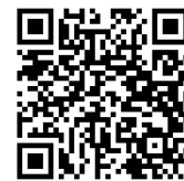
Read Aloud Video

Here is a little background information about our First Chapter Friday title and its creator. Feel free to add your own notes and thoughts in the bottom box.