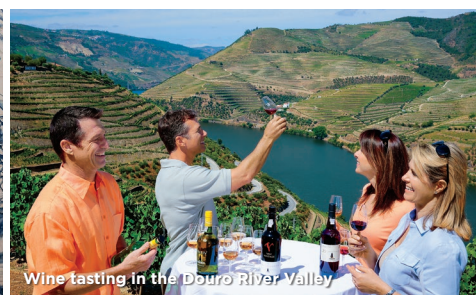
Wine tasting in the Douro River Valley

BOOK BY DECEMBER 31, 2020 AND SAVE $750 PER PERSON ON CRUISE FARE 7-NIGHT RIVER CRUISE ABOARD THE AMADOURO from $4,099 $3,349 per person