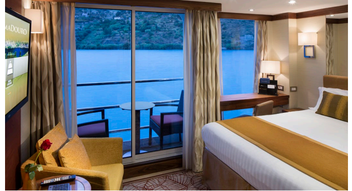
Outside Balcony Stateroom