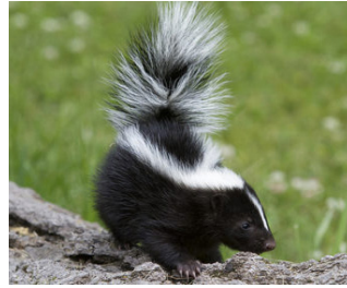
Two Sanctuary favorites!

N: I don't know yet! I haven't quite found my niche yet, but I will. I'll still be gardening at the Sanctuary plenty! I also want to go to Australia and New Zealand. I want to see the animals and the plants there. I don't care as much about the humans. *laughs* You know what I mean!