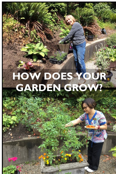
HOW DOES YOUR GARDEN GROW?