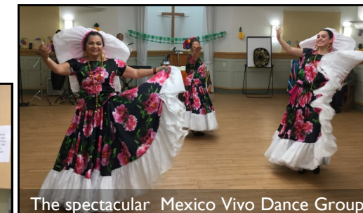
The spectacular Mexico Vivo Dance Group