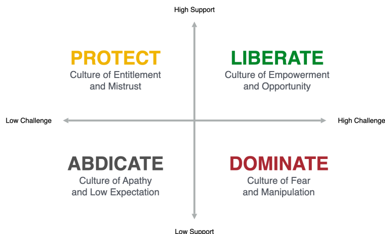
SUPPORT CHALLENGE MATRIX