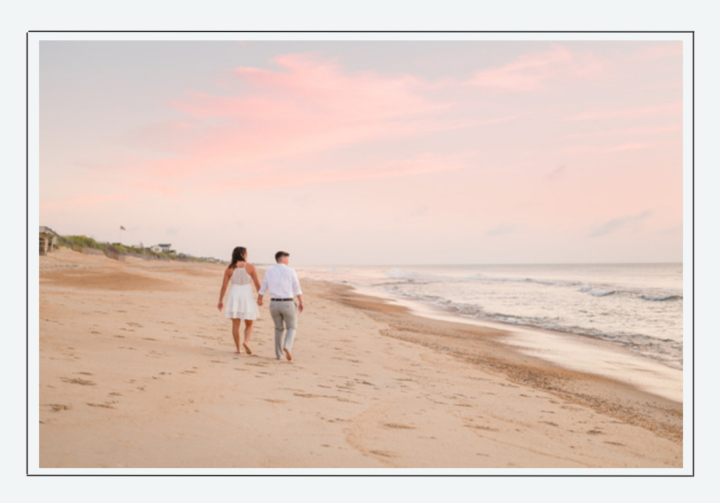
Choose Your Experience