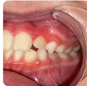
✓ Retractors - L Side