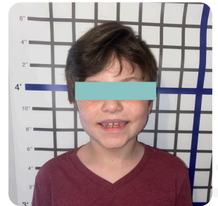
✓ Full Face Smile