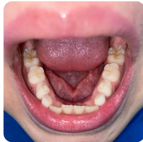
✓ Floor of the mouth