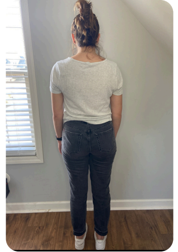
✓ Full Body Back

FACE/PROFILE: Flash on with good natural lighting (facing window) solid background