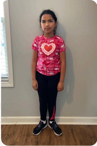
✓ Full Body Front

POSTURE: Show feet with no shoes or socks, solid background, hair pulled back