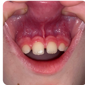
✓ Upper Lip