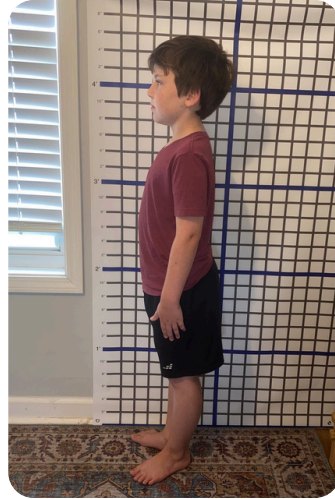
✓ Full Body L Side