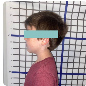
✓ Left Side