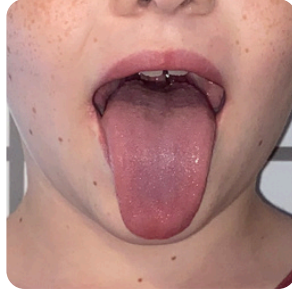
✓ Stick Tongue Out