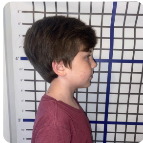
✓ Right Side