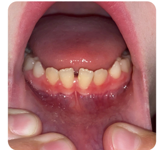
✓ Lower Lip