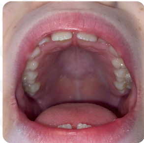
✓ Roof of the mouth