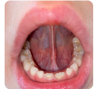
✓ Under Tongue