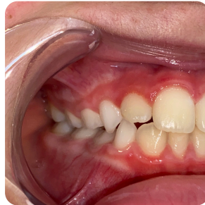
✓ Retractors - R Side