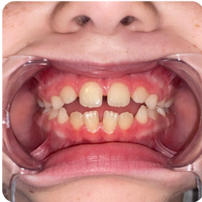
✓ Retractors- Bite