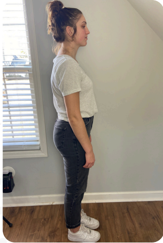
✓ Full Body R Side