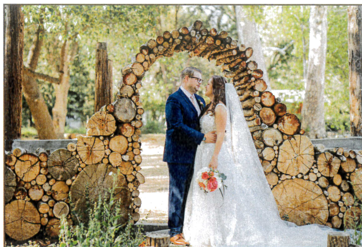
Wild Irish Rose Photography