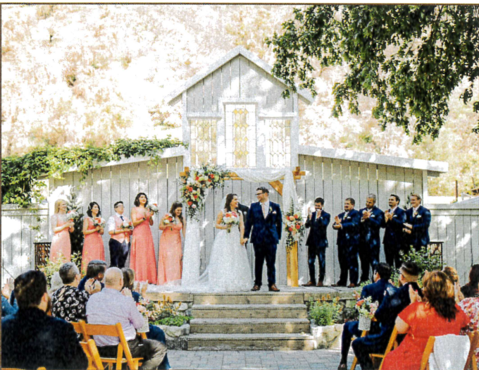
Wild Irish Rose Photography

Start time may be earlier. End time may not be extended.