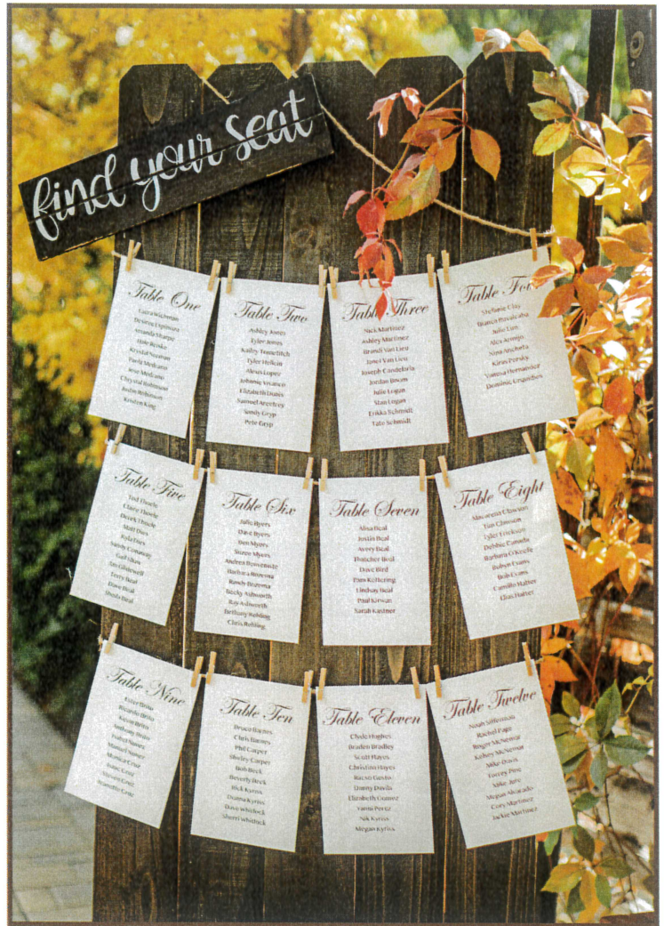
Wild Irish Rose Photography

We have NO Service or Corkage Fees. Gratuity has NOT been added.