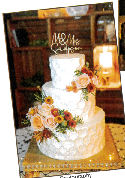
Wild Irish Rose Photography