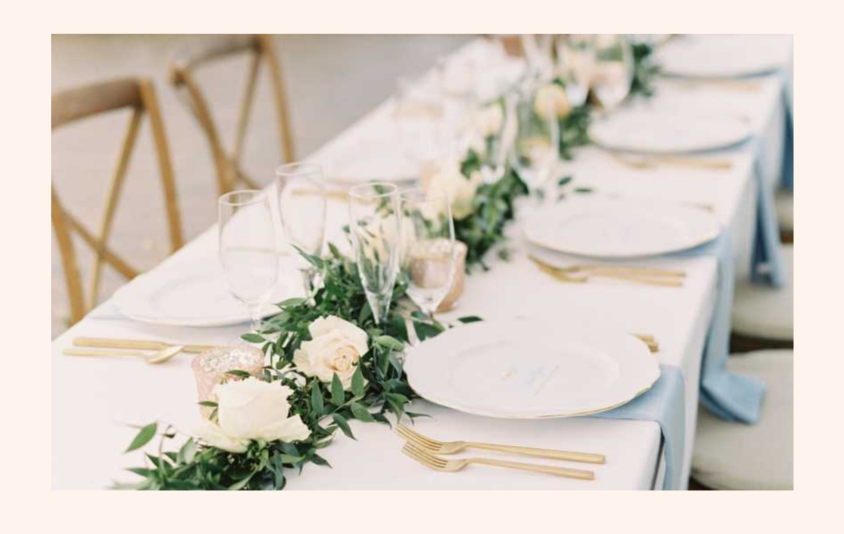
GARLAND MIX GREENERY 8 FT $165