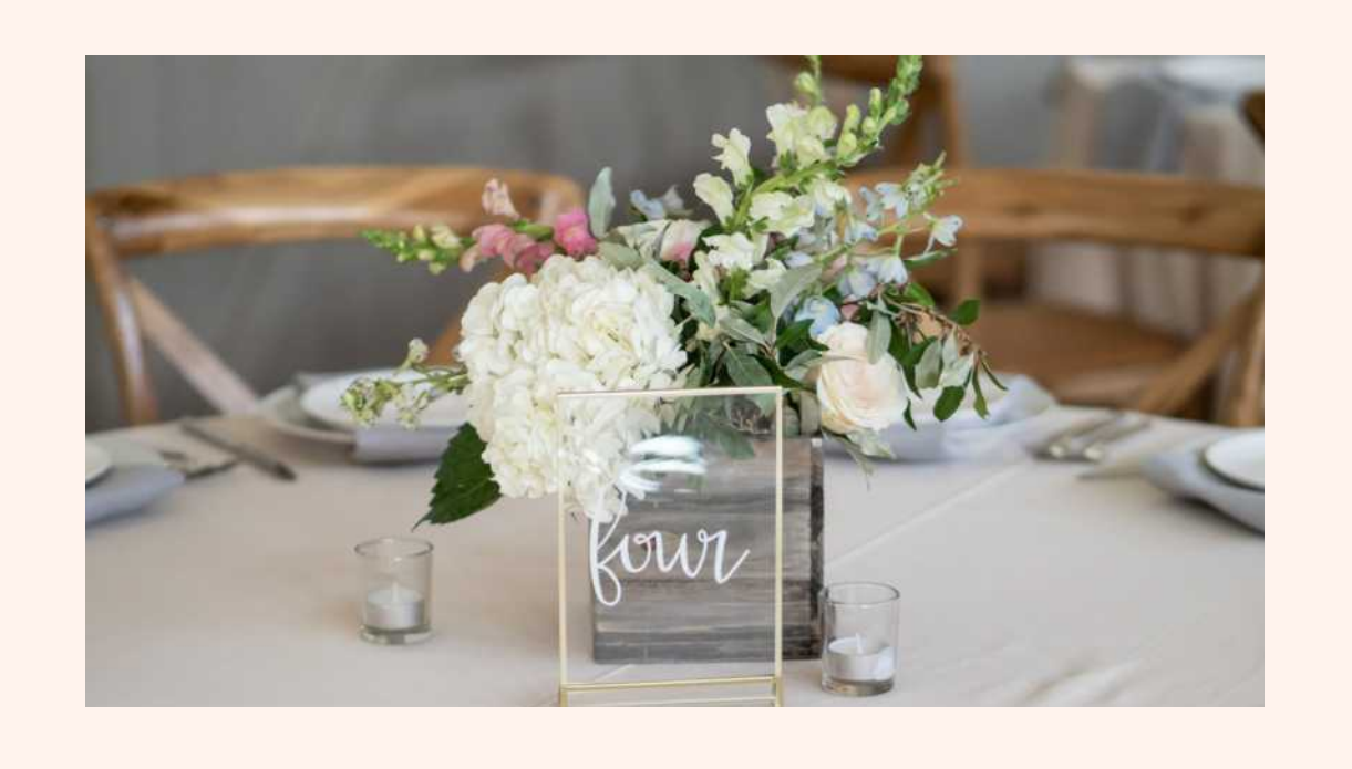
WOODEN BOX ARRANGEMENT $75