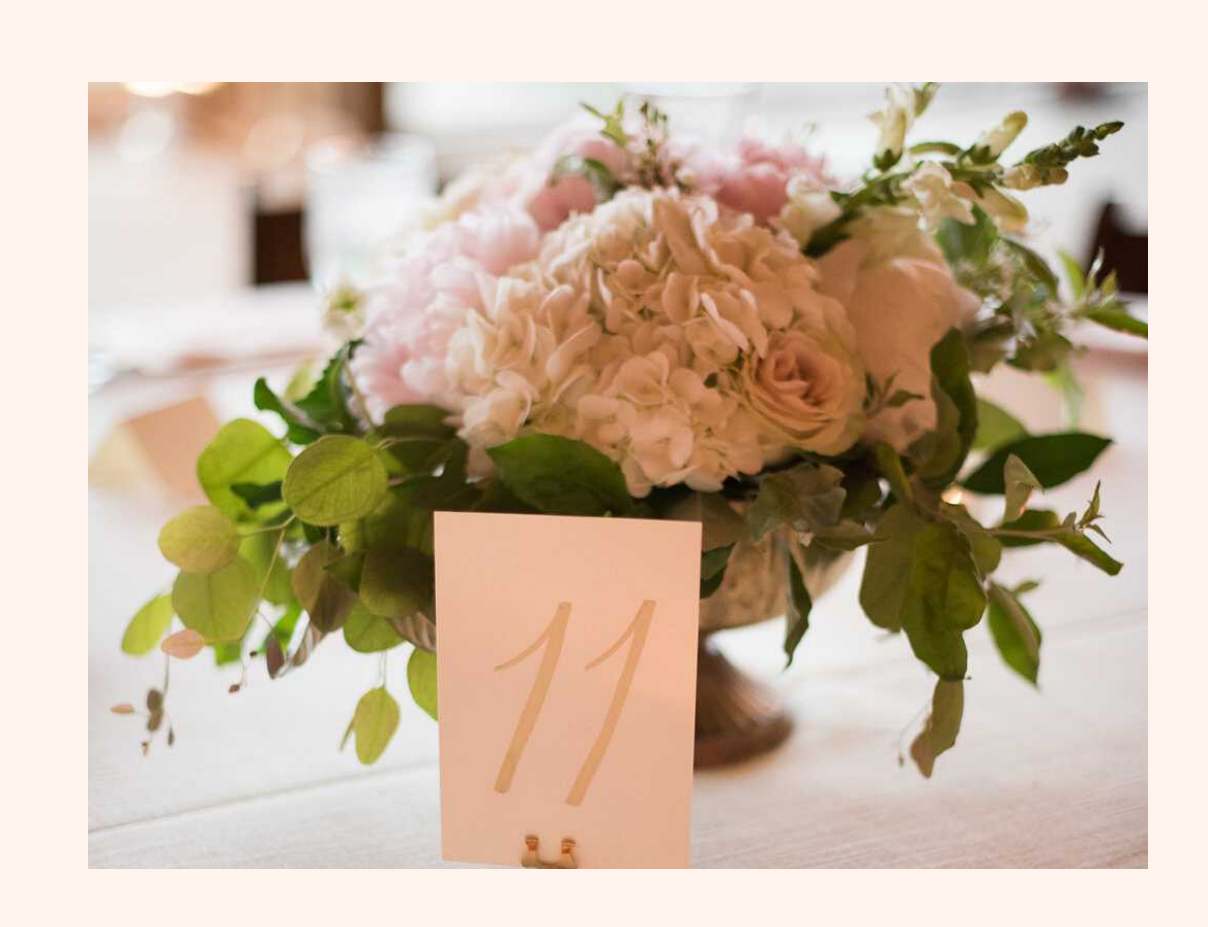
SMALL CENTERPIECE $120