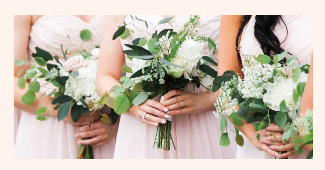
SMALL BOUQUET $75