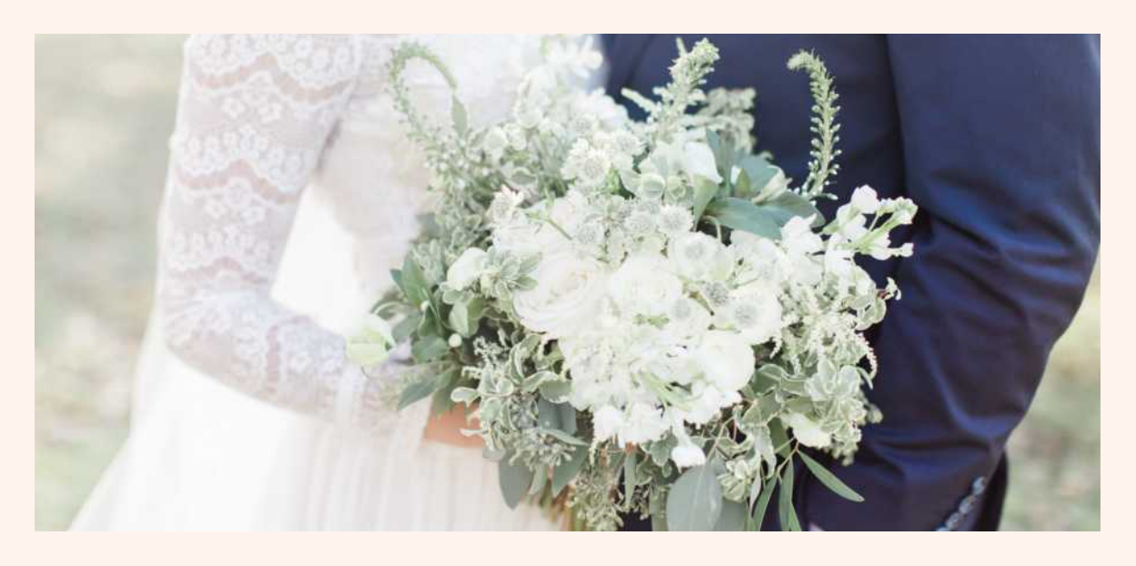
MEDIUM BOUQUET $155