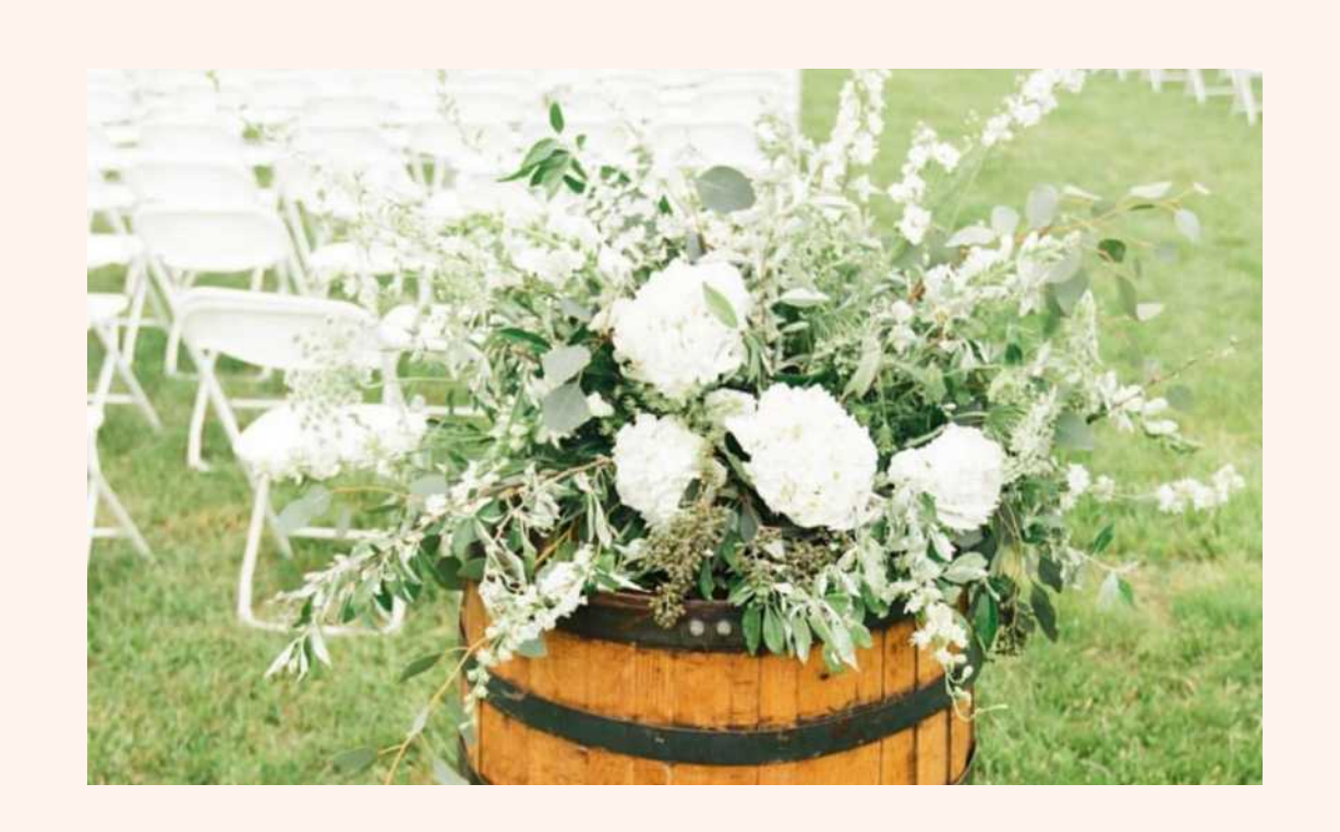
BARREL ARRANGEMENT $250