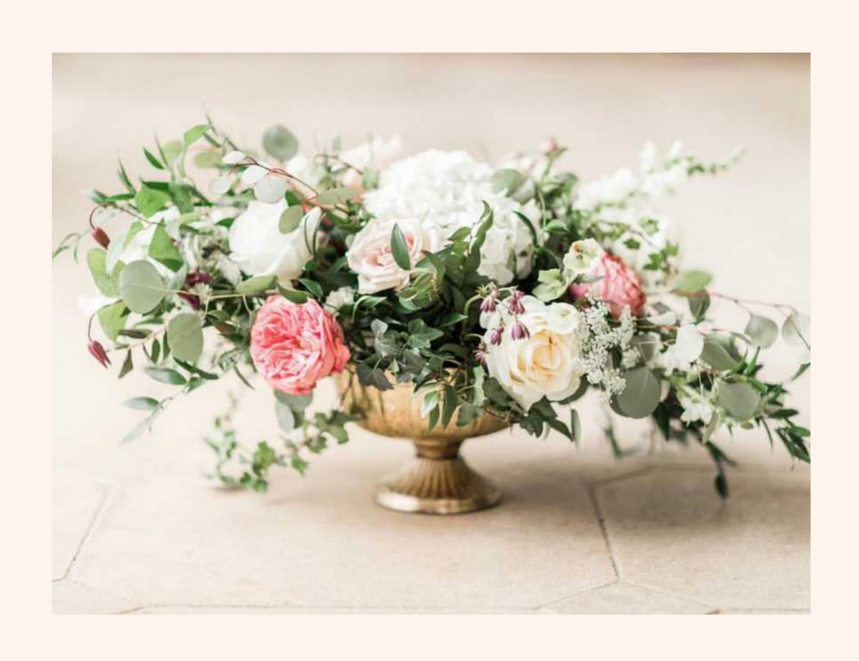
LARGE CENTERPIECE $155