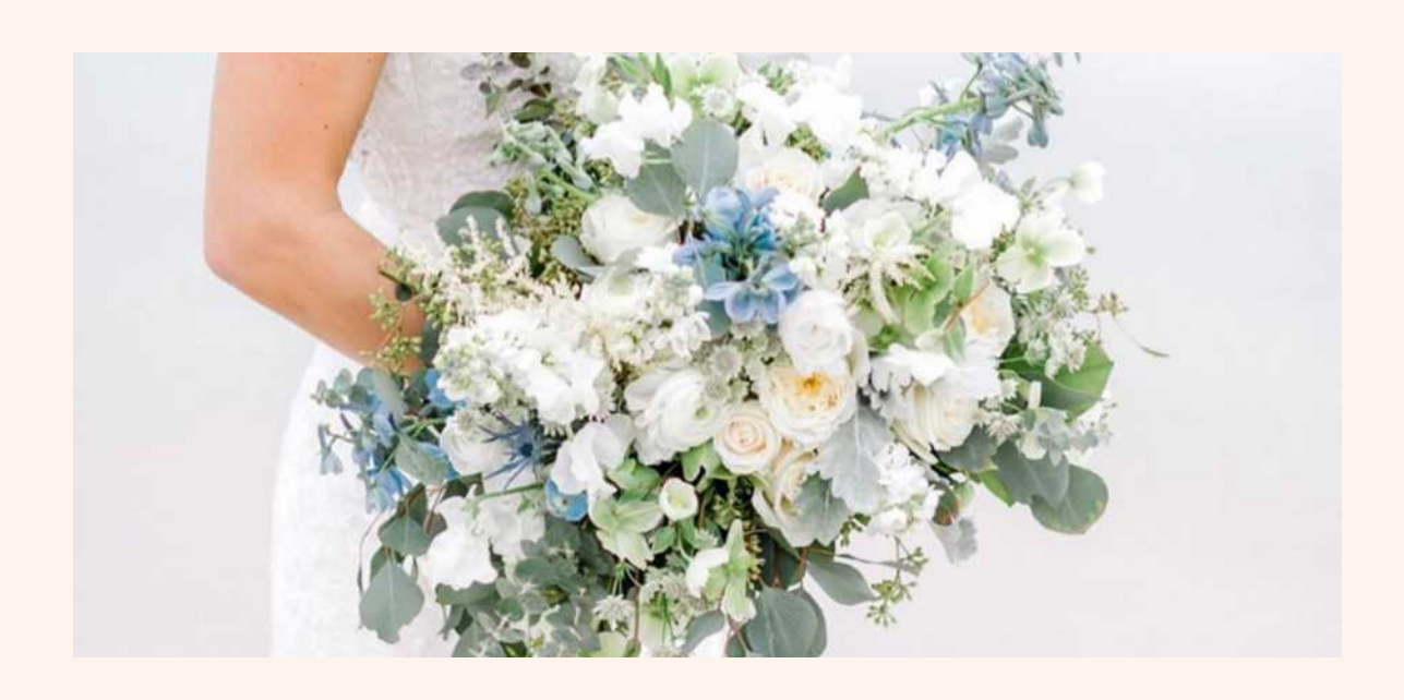
LARGE GARDEN BOUQUET $350