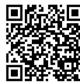
Read Aloud Video

Here is a little background information about our First Chapter Friday title and its creator. Feel free to add your own notes and thoughts in the bottom box.