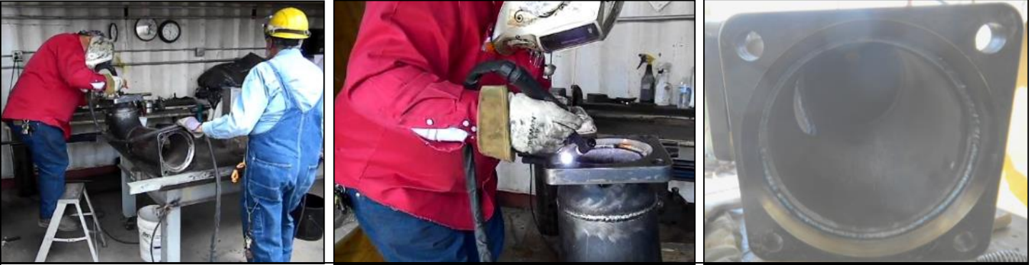
With Ken Dusenberry looking on, Carlos Osuna, long time Local 412 member (now an NMSLRHS member as well) applies his welding skills to attach flanges to one of the large pipe sections. With extensive experience at welding everything from critical piping at nuclear power plants to maze of stainless steel piping at large dairy facilities, Carlos has become a real asset in preparing and refitting the pipes fabricated in Utah.

Steam locomotives have A LOT of pipes, most of which are hidden from view under insulation and sheet metal. They range in size from less than an inch to the enormous ones pictured below. Though some are straight, most have peculiar shapes that make reinstalling them similar to assembling a three dimensional jig-saw puzzle. Fortunately several years ago, when our team removed all the 2926 piping, every item was tagged and details relating to location and function were recorded. They were aware that detailed information would be necessary for reassembly. Unfortunately , many of the pipes, especially those under the sheet metal were severely corroded from years of being covered with insulation that captured and retained moisture. Of course, that meant that new ones would have to be fabricated—with all the same twists and bends that the originals had. It was far beyond our capability.