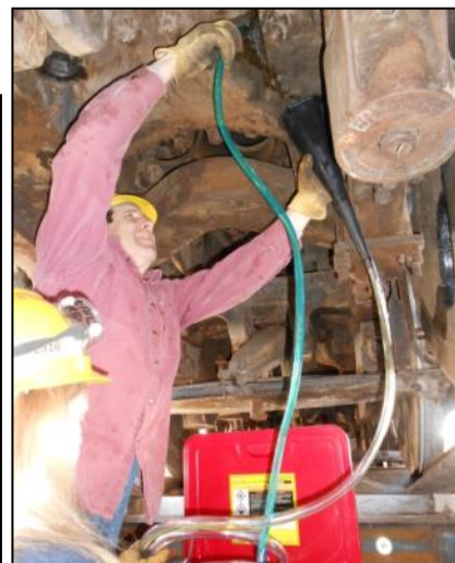
Left and Center: Lurch takes 2926 for a stroll, clearing the pit for a bit of cleanup before moving it back over the pit. Right: Once repositioned over the pit, flushing of the number three and four bearing reservoirs could be done,