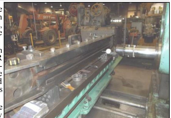
Bottom view of one crosshead guide as it is being checked for alignment.

In the two photos on the right, precise gauges are used to determine the amount of adjustment necessary to correct the bends. Below two GCR crew members are using their hydraulic press to straighten one of the guides. Once the rebabbiting process is complete, the crossheads will be returned to Albuquerque to be installed on 2926, along with the main drive rods.