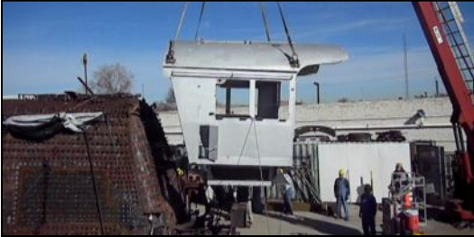
February 2012, Cab Move: The cab was lifted from 2926, placed under a canopy and measurements were made in preparation for installing the cab woodwork.

In February 2012, the cab was removed and placed under a canopy in a corner of the worksite. To keep wanderers, would-be 'helpers', and other nosey types away, the canopy was surrounded by yellow caution tape. Members learned quickly that if you were not assigned to Randy's crew, or had a very good reason for entering the cab site, you didn't cross the caution tape.