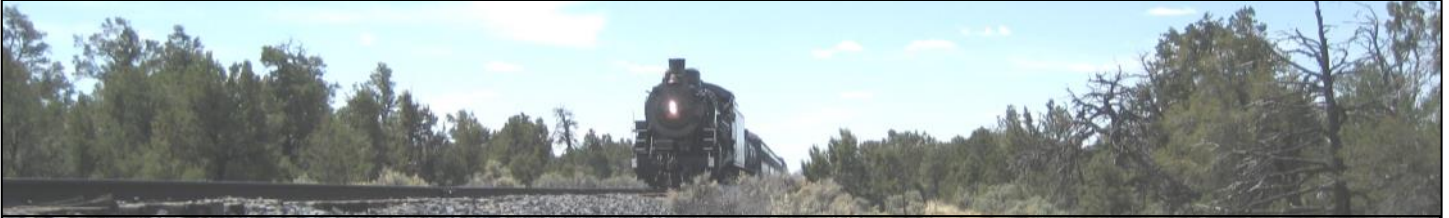
Grand Canyon Railway Number 4966 charges through the pinon-juniper forest between Williams and the Grand Canyon.