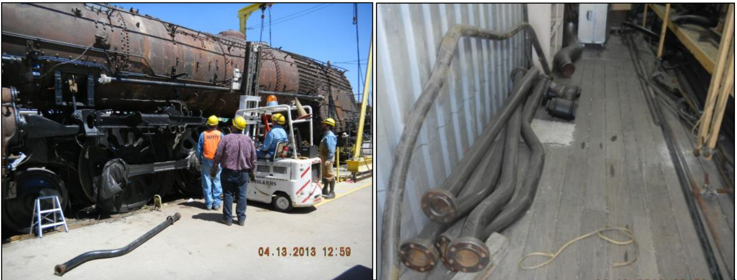
Left: Reinstallation of the 2926 piping begins. Right: Additional recently fabricated pipes are in a storage unit awaiting reinstallation. Without the specialty cranes and other tools that once were available in the backshops, this can be a slow process.

The reinstallation is a slow and demanding process that probably would draw laughs from the oldtimers who worked on the locomotive when numbers of them were still operating. After all, we have neither the skills nor equipment that the steam repair crews had when 2926 was operating. Thankfully, there are skills to be found, and we found just the right skills to perform the critical pipe fabrication and reinstallation job. It is the folks at Plumbers and Pipefitters Local Union 412 and their buddies in Utah.