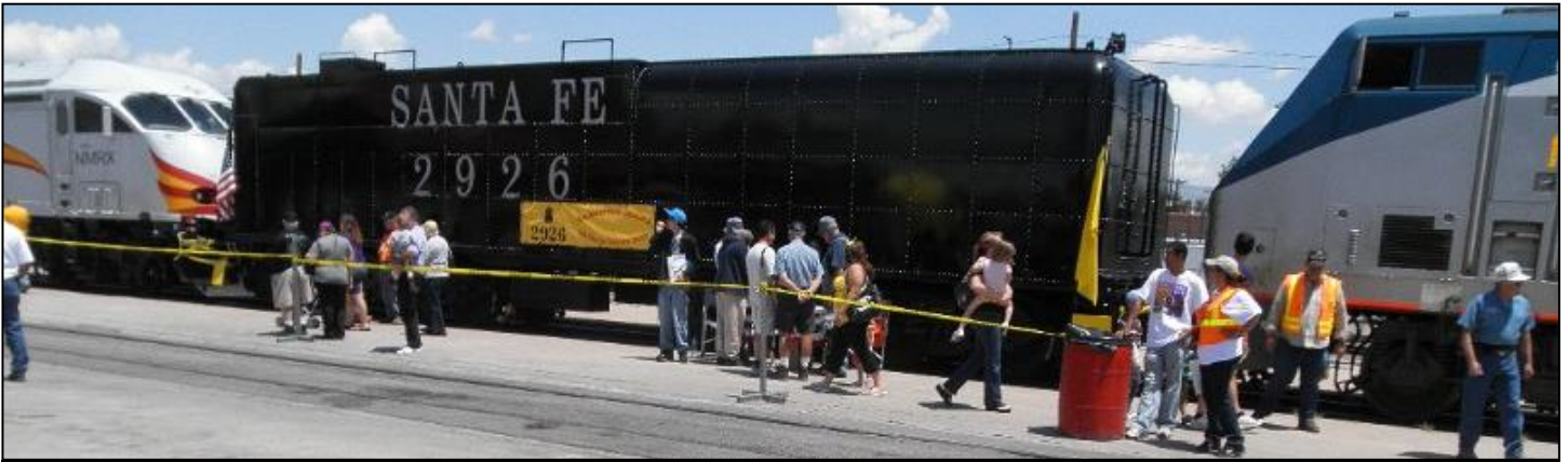
Train Day 2012, the 2926 tender is displayed center stage between Rail Runner and Amtrak diesels.

For the younger Train Day visitors—and the older ones who may have forgotten—generating steam to power steam locomotives meant that water had to be available to produce the steam. Additionally, there had to be fuel to heat the water. Historically, the fuel was wood, coal or oil. That fuel was burned in the locomotive's firebox to heat water to make steam that powered the locomotive. The tender carried both water and fuel, and was coupled directly to the locomotive. Thus, it functioned in the same role as the fuel tank on a car or truck. Since 2926 burned oil, its tender, one of the largest steam locomotive tenders ever built, carried 7,150 gallons of oil in a tank resting in a pocket in the front of the water tender. If 2926 had been coal powered, that pocket in the front of the tender would have contained coal. The main body of the water tender has capacity for 24,500 gallons of water.