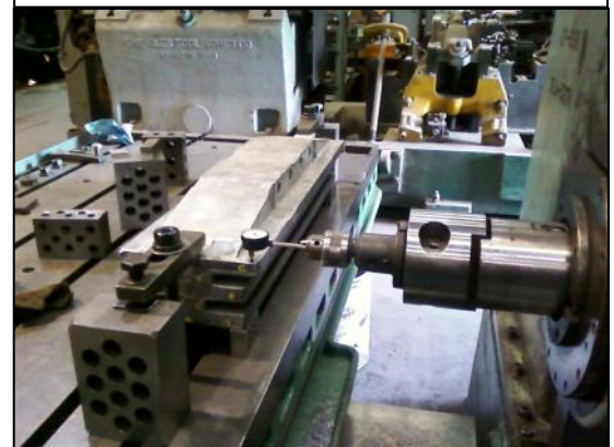
A view of the crosshead 'shoe' that contains the layer of Babbitt to provide a wear surface.