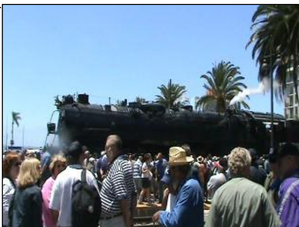
Standing Room Only: Downtown San Diego, June 2008, AT&SF 3751, 2926's oldest sister rolls into town. She drew large crowds along the route from L. A. to San Diego. The picture on the masthead of this newsletter is 2926 at the same location in 1950.

Yes, we have arrived. The numbers of visitors will continue grow. AT&SF 2926 has become a tourist attraction well before its first steam up. All are eager to see 2926 in operation, and much like kids on a trip, the question is, "Are we there yet?"