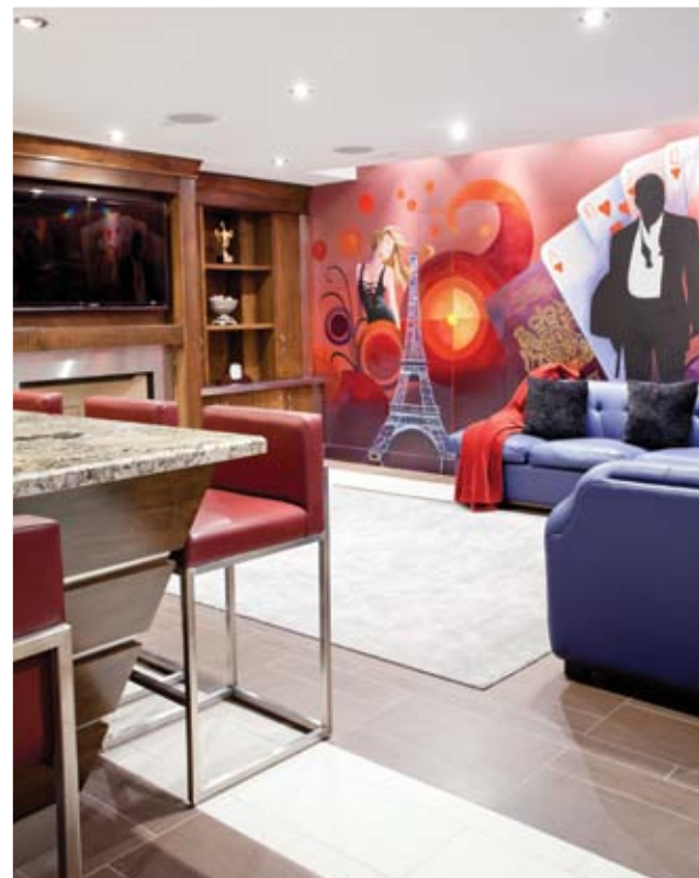
TOP: A window in the man-cave exhibits an Aston Martin Casino Royale on a lift which brings it down from the garage. ABOVE: A James Bond mural sets the scene for cocktails and cigars.