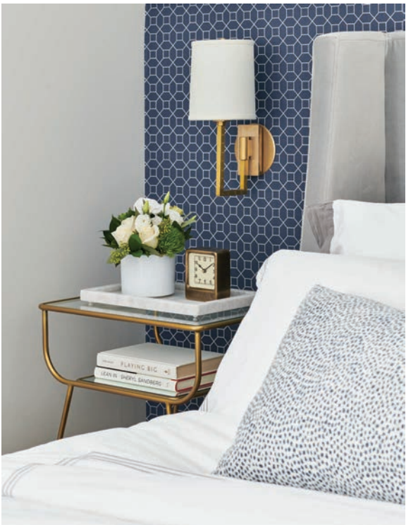
ABOVE: The sloped space was creatively addressed by adding wallpaper and fabricating a custom headboard. Now the bed looks like it was always meant to be there. FAR LEFT: Soothing neutrals exude elegance and relaxation in the primary bedroom. LEFT: The contrast of the darker hue allows the gold accents to shimmer and reflect.