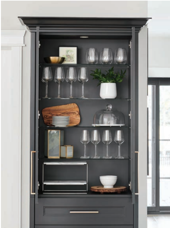
Entertaining needs are beautifully displayed and accessible just off the kitchen.