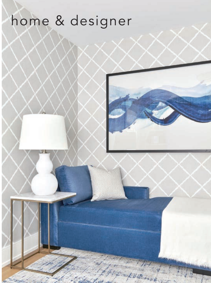
LEFT: A chaise instead of a traditional lounge chair is a cosy space to stretch out and read. BELOW: The office is fresh and light to encourage the “work from home” vibe.