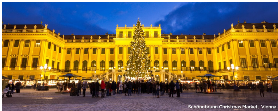
Schönbrunn Christmas Market, Vienna