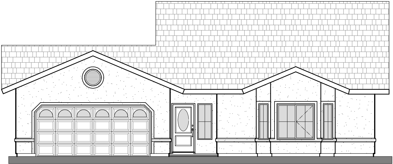
(elevation 'A' w/ stucco)