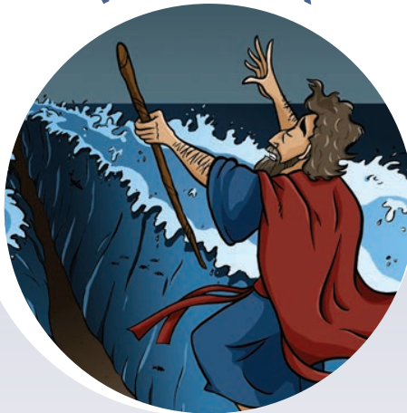
God parts the Red Sea Exodus 14:1–15:21