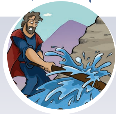
God preserves Israel Exodus 15:22–17:7