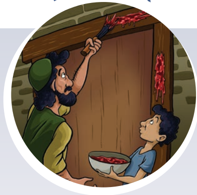
God ordains the Passover Exodus 11:1–13:22