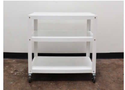
WHITE ROLLING CART Can be removed if requested.