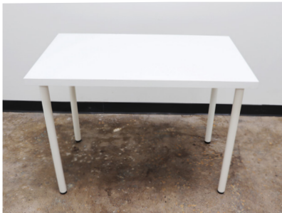
3 WHITE TABLES 39.5" L x 23.5" W x 29" H Additional available at $10 per table