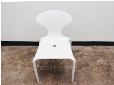
30 WHITE CHAIRS Additional available at $2.50 per chair

Yes, we will have the room set-up based on your requests. The farm tables can be separated into two 20'ft x 3'ft tables that seats up to 30, or pushed together for one large 20'ft x 6'ft table that seats up to 18. We will have out as many chairs as needed for your rental (up to 30, however more can be rented at $2.50 a chair)