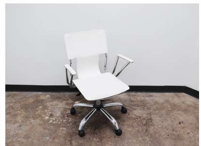
3 OFFICE CHAIRS Stored in the flex office and can be removed if requested.