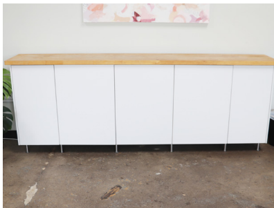
CREDENZA 97" L x 16" W x 36" H Butcher block on top. Cannot be removed from the space.