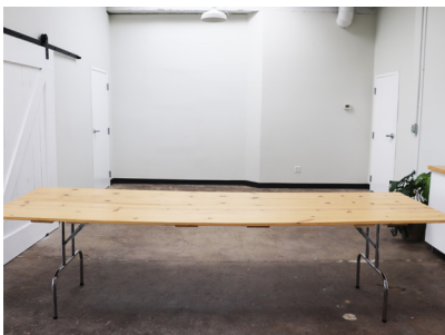
4 FARM TABLES 122" L x 37" W x 30" H One Large Table Seats up to 20 Two Long Tables Seats up to 36