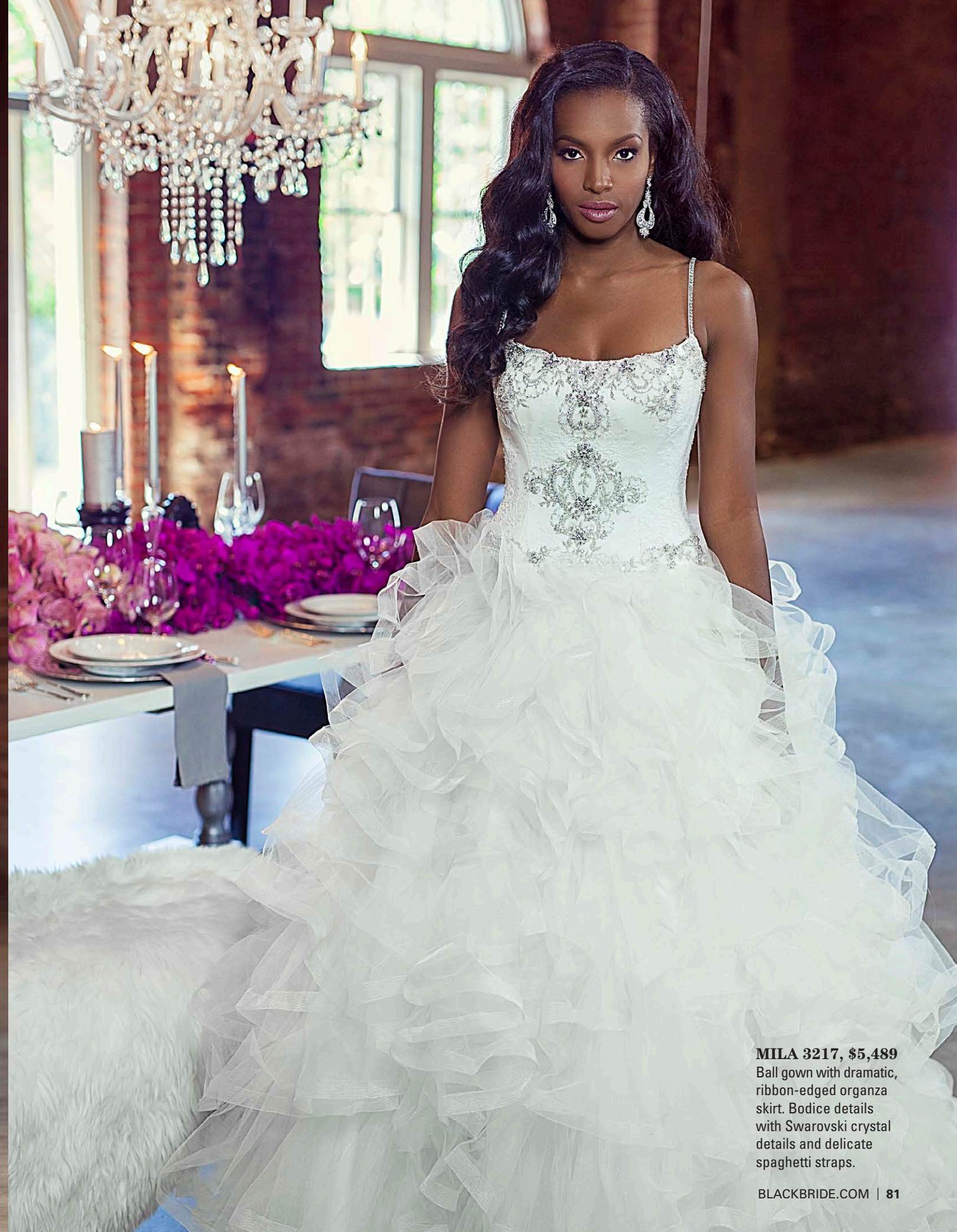
MILA 3217, $5,489 Ball gown with dramatic, ribbon-edged organza skirt. Bodice details with Swarovski crystal details and delicate spaghetti straps.