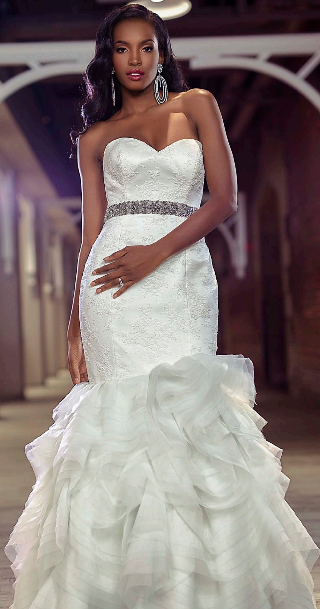
NICOLETTE 3210, $4,489 Alençon lace mermaid gown with asymmetrical organza layered skirt. Detailed with Swarovski crystal embellished belt and sweet heart neckline.