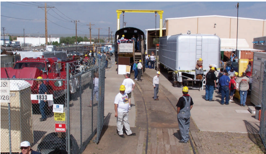
Open House 2005

Once disassembled, 2926 may look more like the contents of a spare parts yard than a locomotive.