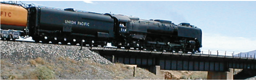
UP 844 At Speed Crossing An Arroyo North Of Tularosa

Union Pacific 844 came to a stop in Alamogordo next to a park with a garden train and a crowd of onlookers. Crowd control tape separated the park from 844 on the east side. It did not take long for the crowd to wise up and get closer. They went up the street and crossed over the tracks to gain access to the locomotive between the track and a warehouse belonging to the New Mexico Museum Of Space History.