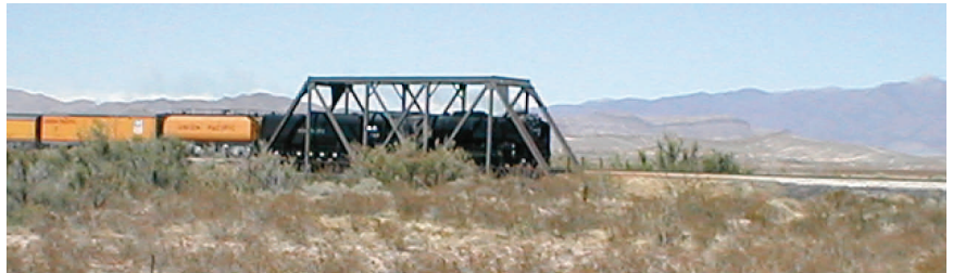
UP 844 Cruises Through A Steam Era Trestle Near Carrizozo

On two days in May, a number of NMSL&RHS members had a chance to more clearly understand Ed's motivation. As we chased UP 844 on its recent excursion through eastern New Mexico, we were really chasing Ed's dream. It was very easy to look at 844 steaming across the desert between Carrizozo and Alamogordo and visualize 2926 returning to its glory days on AT&SF tracks in other parts of New Mexico.