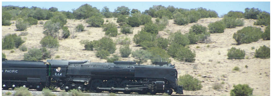
Heading For Tularosa, 844 Speeds Down A Slight Grade Past A Juniper And Pinon Landscape.