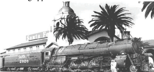
Our Locomotive In Its Prime: San Diego, Circa 1950

Put October 21 on your calendar now. Plan to bring the kids, bring your camera, and bring a hot dog appetite.