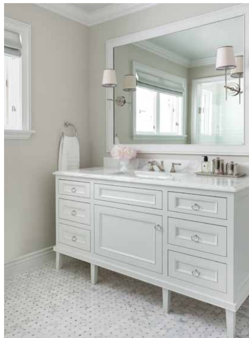
A custom vanity by Warner's Cabinets sits on marble basket-weave flooring from Statements Tile in the guest bathroom; the polished-nickel sconces by Visual Comfort add sparkle, and an oversize custom mirror reflects the natural light. The designer wanted to choose pieces that would stand the test of time.