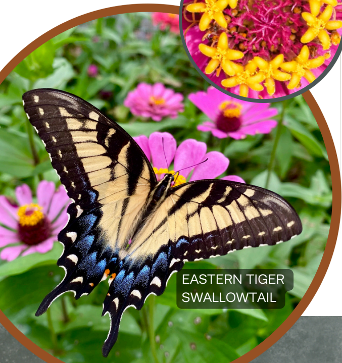
EASTERN TIGER SWALLOWTAIL