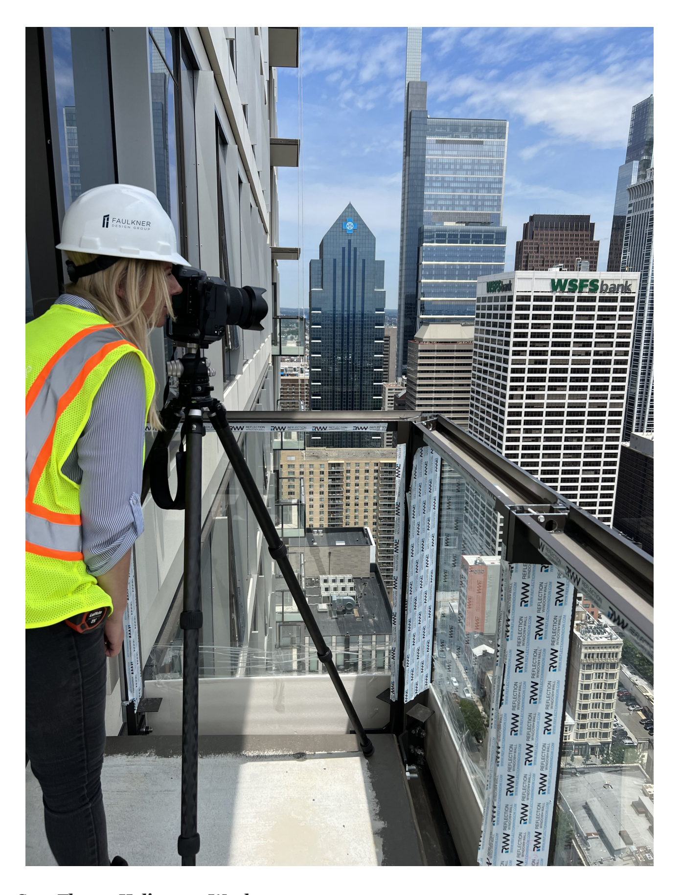
Stop Three: Helicopter Work