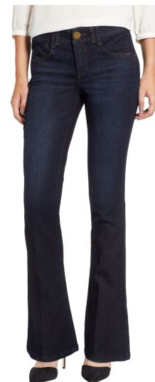
Wit & Wisdom